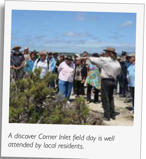
A discover Corner Inlet field day is well attended by local residents.

The project outcomes have been extensive. They include the immediate end of stock damage to hundreds of hectares of coastal saltmarsh at project sites, decreased sedimentation and nutrient runoff into the Corner Inlet and Nooramunga estuarine and marine ecosystems, the creation of an ecological buffer zone between farmland and the wetlands, and the protection and enhancement of critical flora and fauna habitat.