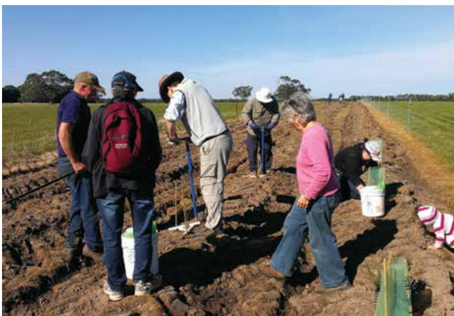
An annual Moorabool Catchment Landcare Group tree planting day on a member's property.