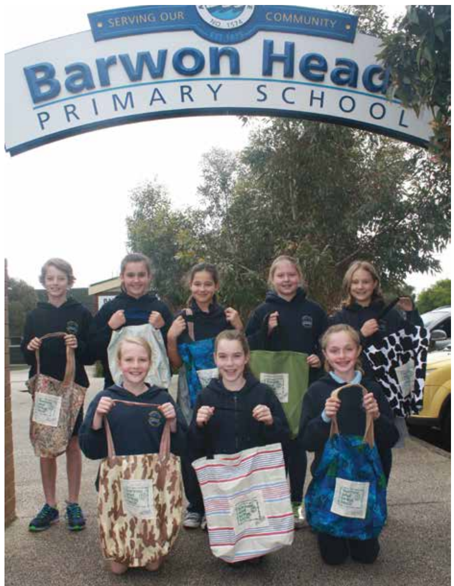
Students from Barwon Heads Primary School with reusable jute shopping bags they helped to make.