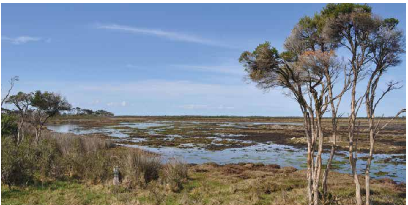
Yarram Yarram Landcare Network's saltmarsh protection project site adjoining Nooramunga wetlands.