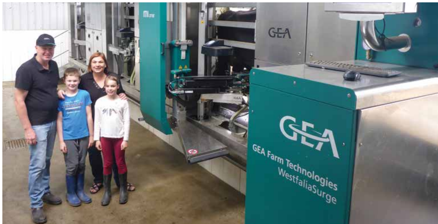
The Mills family from Drouin South with their new robotic dairy.