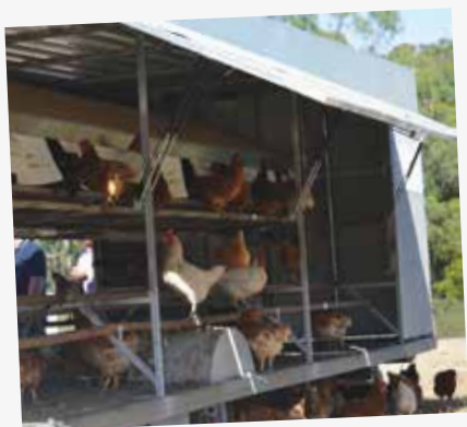
Tom's chook caravans follow a rotationally-grazed beef cattle herd.

"Being a smaller-scale producer has its challenges. Farm efficiency is critical. Carrying capacity has to be matched with consumer demand. I'm confined to the 130-hectares of the property, but I'm looking at adding a third product – chicken meat or pork are in the planning phase."