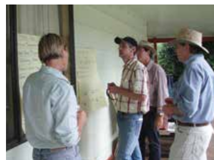
Members of the Far East Sustainable Agriculture Group planning priorities and actions.

Three stock containment areas were also established on the EverGraze Project property. Other group members were able to view how these areas can be used in managing drought and flood as well as to lessen the invasion of pest plants and