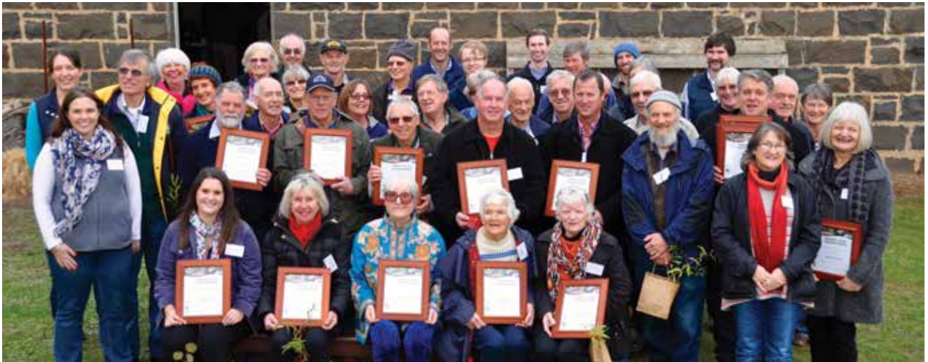
Winners of the 2015 Corangamite Landcare Recognition Awards at Inverleigh in June.

The networks will be supported through a project implementation phase with regular reviews of the implementation, effectiveness and impact of their plans.