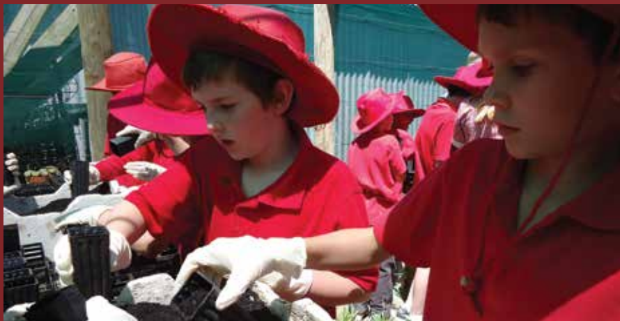
Students from Newham Primary School potting up tube stock with seedlings they have grown from seed they collected.