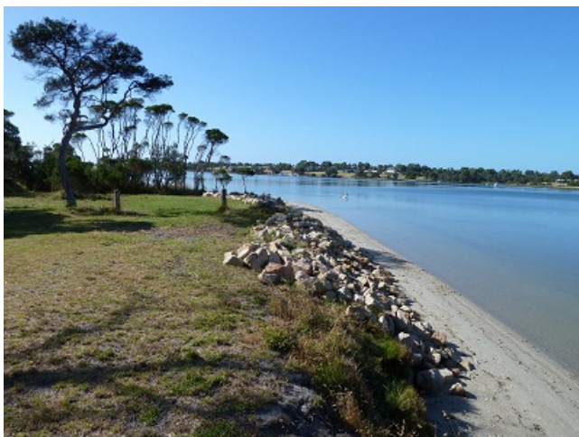
FIGURE 6 - EXAMPLE OF LOCATION FOR BENCH SEATING

As there are no official rest areas along the track, users would benefit from the installation of a number of bench seats. Figure 6 shows an example of a location for such a bench seat.