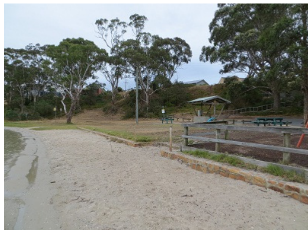
FIGURE 5 - SUNSET COVE PLAYGROUND SURROUND

Some erosion to the trackside is evident past the west point of Sunset Cove, as shown in figure 4.