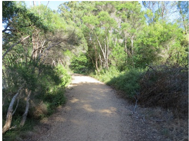
FIGURE 3 - TYPICAL SECTION 1 TRACK

In addition, the Sunset Cove beach is being invaded by Kikuyu grasses at the western end which reduces the amount of sandy beach available for use by visitors. The Barbecue installed here is in excellent condition.