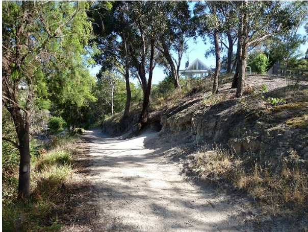
FIGURE 4 - SECTION 1 TRACKSIDE EROSION

This section has a formed gravel track following the shore line, which is in reasonable repair and allows ready access by service vehicles, etc. The environment sustains native flora and fauna; however invasive weeds are present, along with long grass.