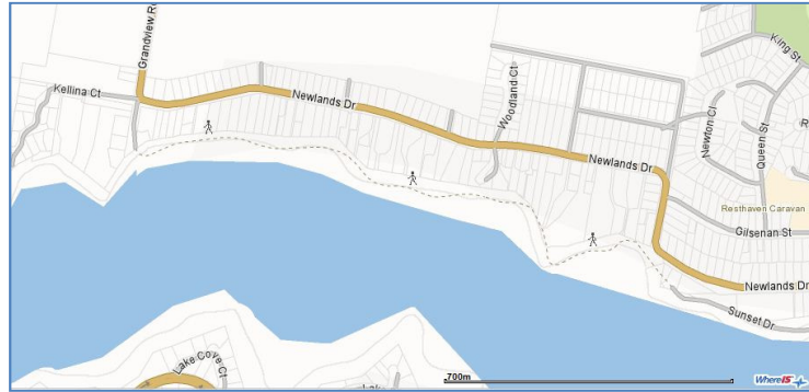
FIGURE 1 - SUNSET COVE WALKING TRACK

For the purposes of this plan, the section of the Paynesville Foreshore Walk from the end of Sunset Drive, near the Sunset Cove Playground, through to the East Gippsland Water Pumping Station at the bottom of Backwater Court is named the Sunset Cove Walking Track . The track extends for some 1.5km along the foreshore.