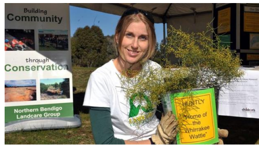
Propagation of the rare Whirrakee Wattle, native gardening workshops and demonstration gardens.