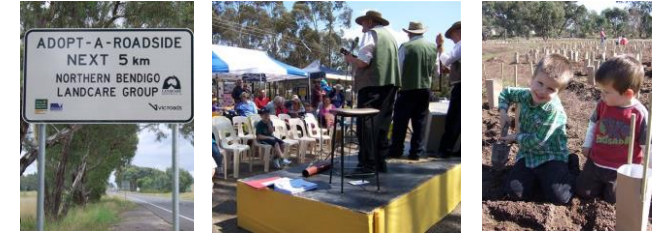
Environmental field days, workshops, community festivals, National Tree Day & Adopt A Roadside.