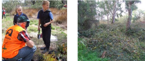
Revegetation, invasive plant treatment, nest box installation and community engagement activities.