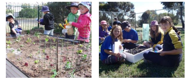
Incursions, excursions, field days and sustainability support for local Primary Schools & Kindergartens.