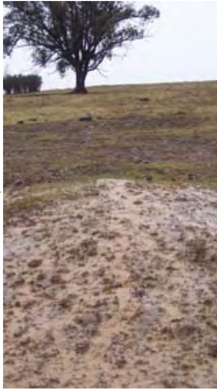
As the tunnel develops under the ground, the top profile collapses and holes form in the paddock. The lack of vegetation shows the location of the erosion between the holes.