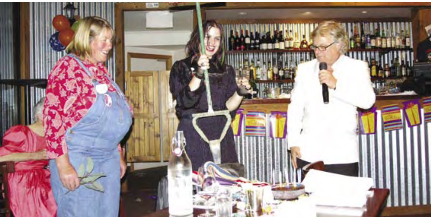
The girls prepare to cut the cake during Landcare's 21st birthday party at the annual forum.