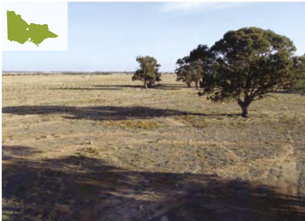
Before. The Kamarooka project site looking west in June 2005.