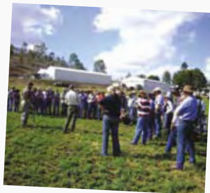
A soil health workshop on a lucerne farm at Goobeyjan in Queensland.