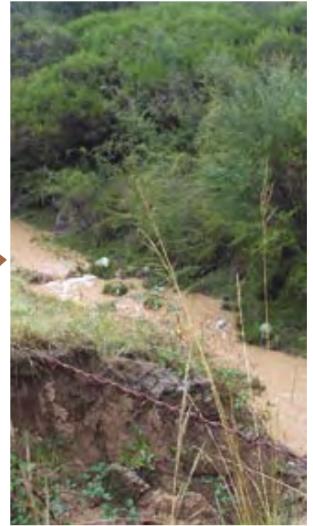
The highly dispersive sediments are transported with the water from the paddock during rainfall events to the gullies, creeks and rivers.

The trial had three steps. The first was to influence the soil chemistry through the use of gypsum and lime to reduce the dispersive nature of the soil. These were spread over the paddocks before works commenced. The second step was the mechanical disturbance of the soil profile by deep ripping with a bulldozer. The third step was the establishment of perennial pasture to use the local water in the soil profile before it has the ability to infiltrate in large quantities.