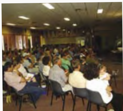
The annual soil forums are proving to be very popular local events.