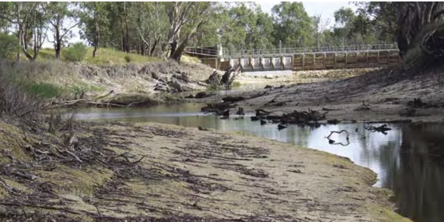
The Wimmera River was dry at Dimboola Weir for the Walk Back in Time trek last October.