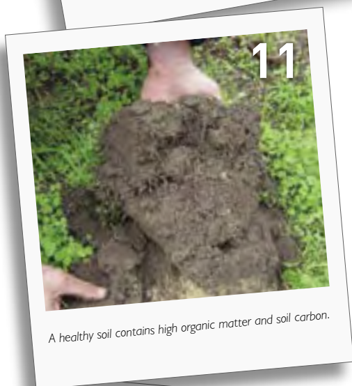
A healthy soil contains high organic matter and soil carbon.