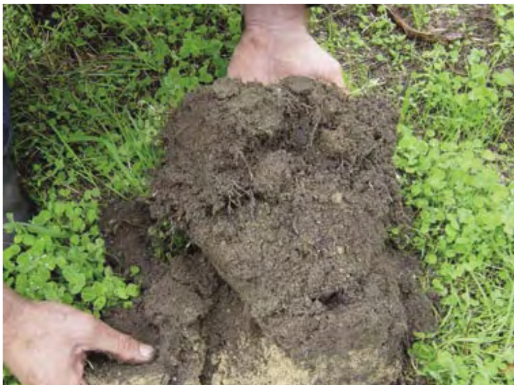
A healthy soil containing high organic matter and soil carbon.