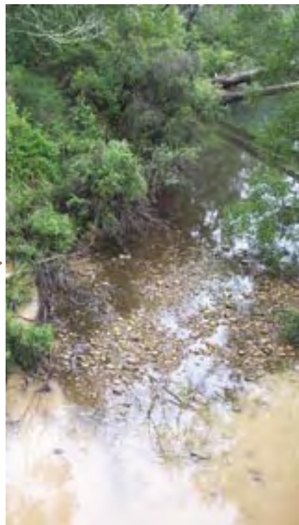
The transport of sediment and nutrients via gullies, creeks and rivers.