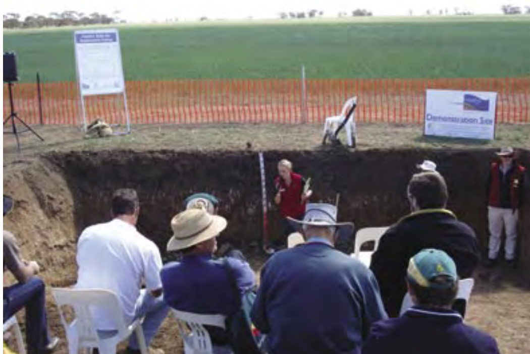
A soil health discussion underway at the Birchip main field day soil pit.