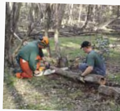
The Landmate crews have worked in the Myrrehe Valley, along the Rose River, and around Harrierville and Tolmie in North East Victoria.