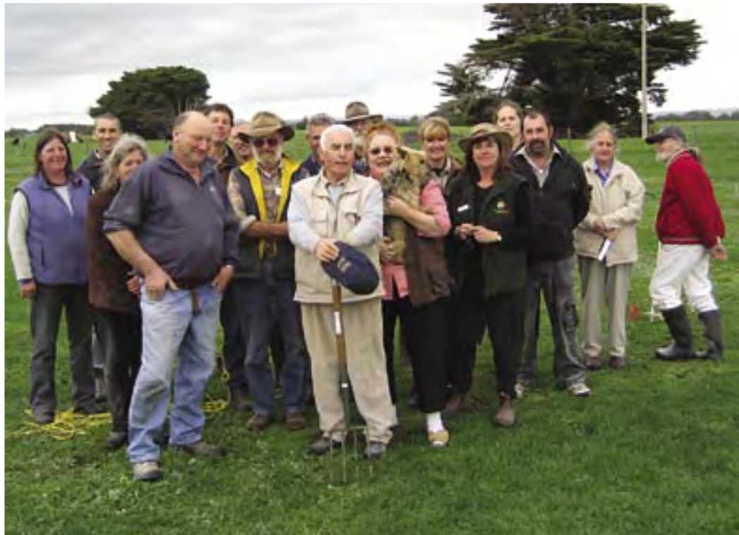
Participants at the soil health fertiliser field day at Vervale last September.