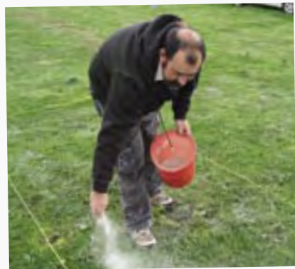
Local farmers helped to apply lime to the trial plots.

A number of farmers have approached the Westernport Catchment Landcare Network (WPCLN) concerned about the increasing levels of metabolic disorders in their beef and dairy cattle. They were wondering if the continual use of chemical based fertilisers was locking up minerals in the soil and making the minerals less available to the pasture. The cattle would then be potentially lacking in minerals and more susceptible to metabolic disorders.