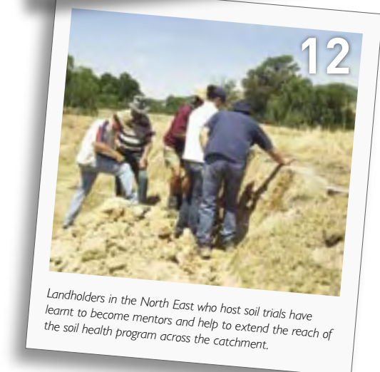
Landholders in the North East who host soil trials have learnt to become mentors and help to extend the reach of the soil health program across the catchment.

The Victorian Landcare and Catchment Management magazine is published by the Victorian Government Department of Sustainability and Environment and distributed in partnership with the Victorian Farmers Federation and the Victorian Catchment Management Council. The magazine aims to raise awareness of Landcare among Victorian farmers, landholders, the Victorian Landcare community and the wider community.