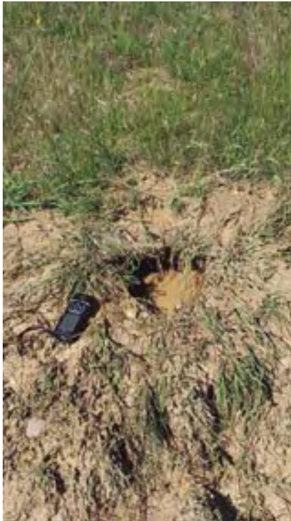
Tunnel erosion can appear innocuously as a small hole that water and suspended sediments flow through.