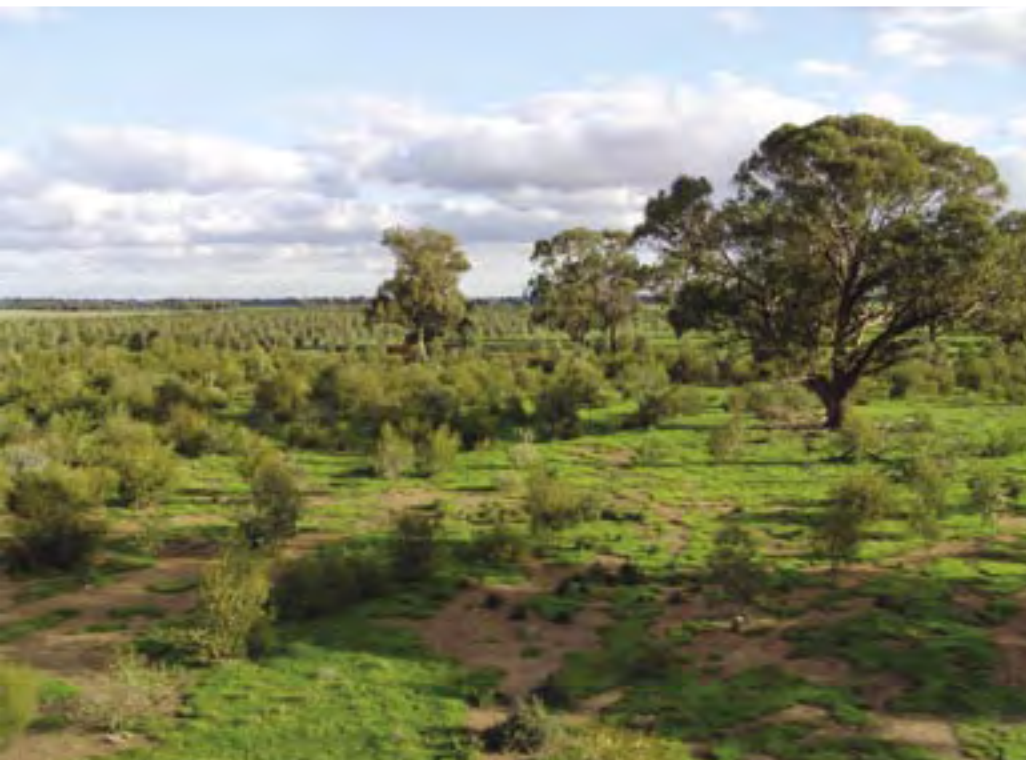
After. The Kamarooka project site looking west in June 2007.