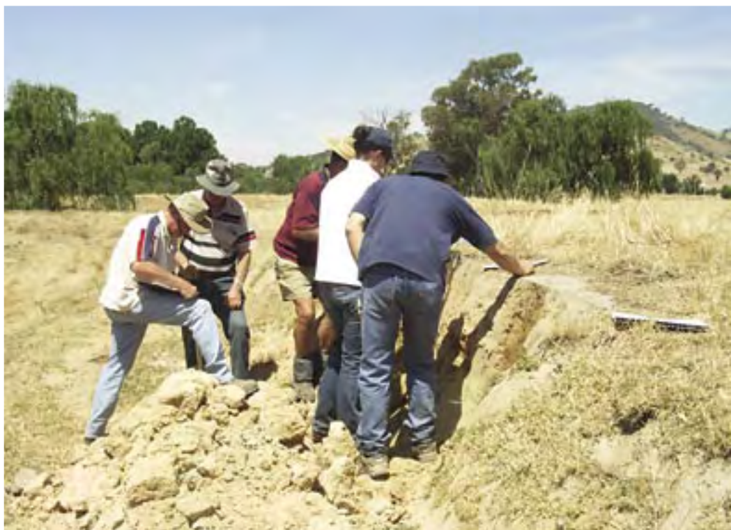
Landholders who host soil trials have learnt to become mentors and help to extend the reach of the soil health program across the catchment.