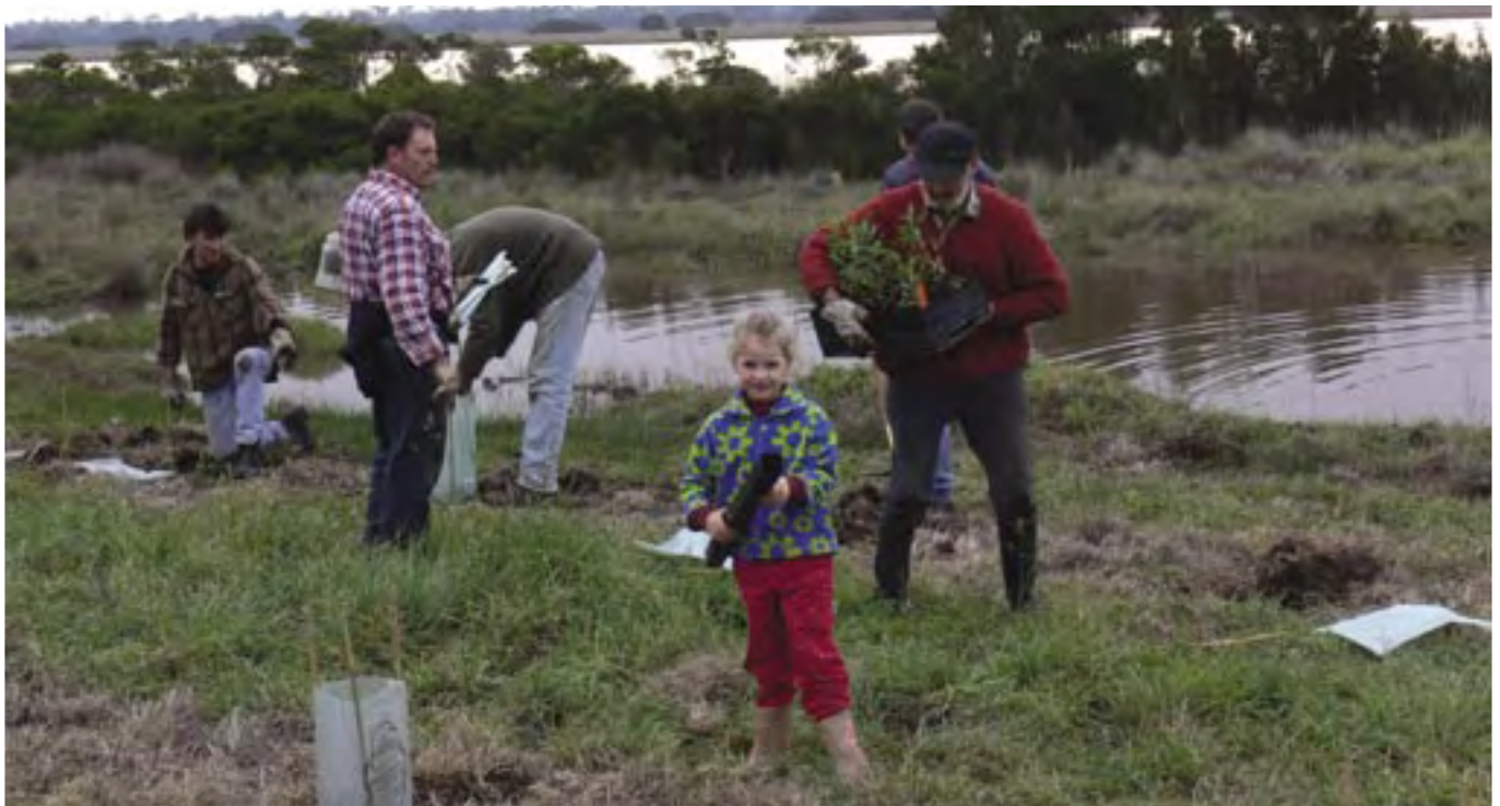
A group of deerhunters plant trees at Clydebank Morass.

Go to www.dpi.vic.gov.au/vro and www.dpi.vic.gov.au/vro/soilhealth .