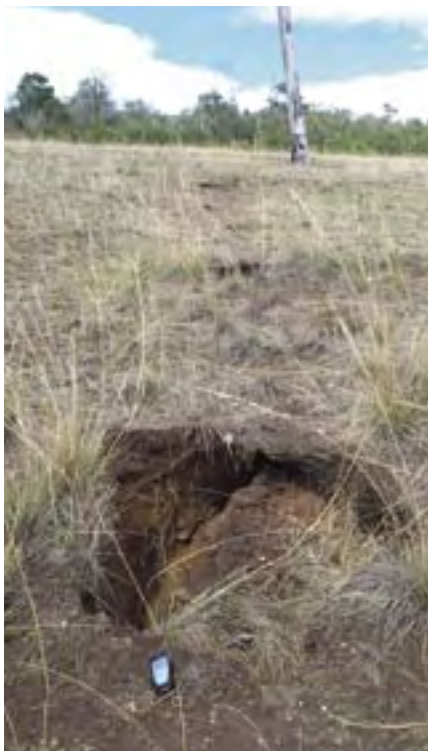
Holes in the paddocks of the catchment caused by tunnel erosion.