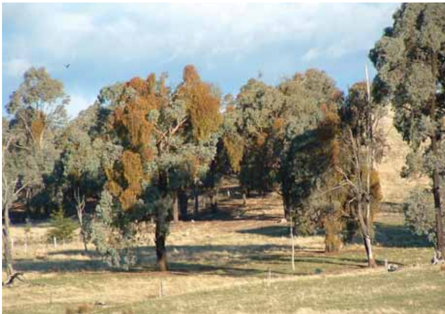
A typical case of severe mistletoe infestation in scattered paddock trees. Note the complete lack of understorey shrubs that are needed to attract the butterflies, possums and birds that keep mistletoe in balance.

Mistletoe plants are native parasites that live by attaching their roots deep into the bark of a tree, and extracting nutrients from the host rather than the ground. There are dozens of different species across Australia, many of them carefully adapted to living in a particular environment. For example, they often cleverly camouflage with the host tree to escape leaf-eating predators.