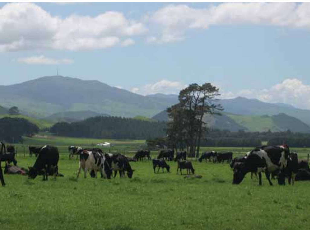
Soil carbon research in New Zealand is concentrating on improving grazing land management.