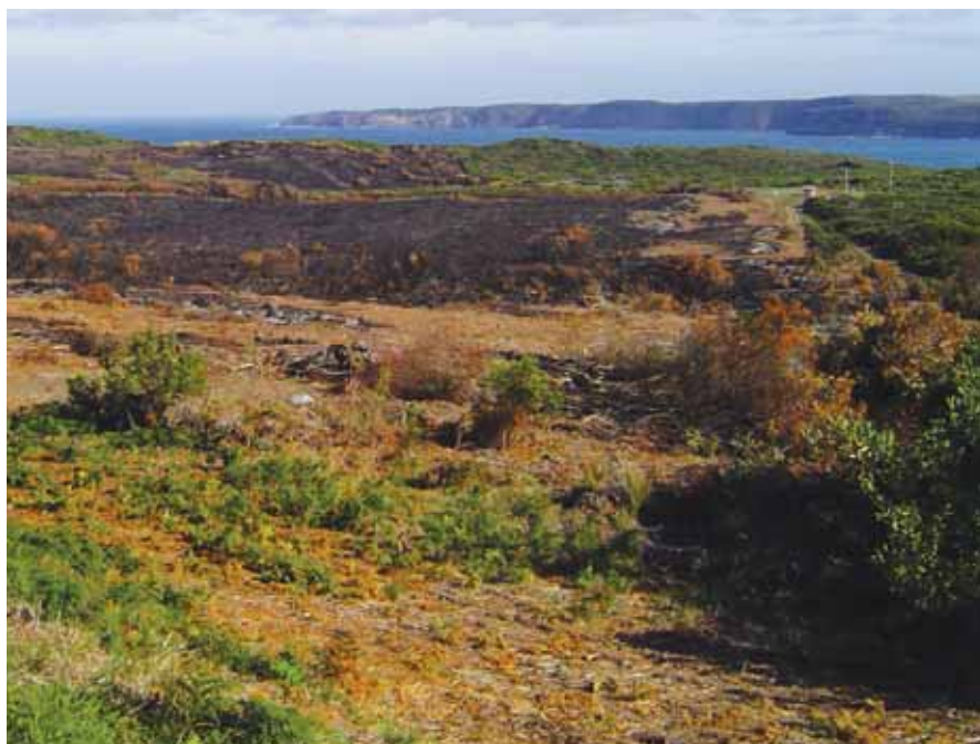
The degraded heathland site in 2007.

For further information contact Brad Henderson on 1300 926 666.