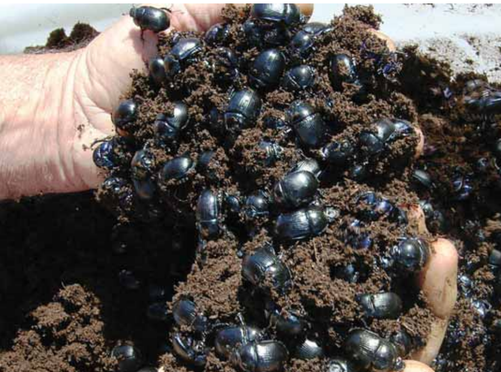
Dung beetles ready for release in the north east.