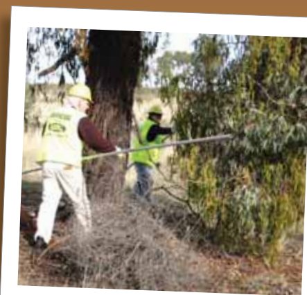
Volunteers selectively remove mistletoe using hand pruning saws on long poles.

The recent trip involved the use of a trailer-mounted 15-metre cherry picker, generously donated for the weekend by Boom Sherrin. Pole hand saws were used to clear mistletoe lower down the tree, leaving the cherry picker for the otherwise inaccessible higher canopy work.