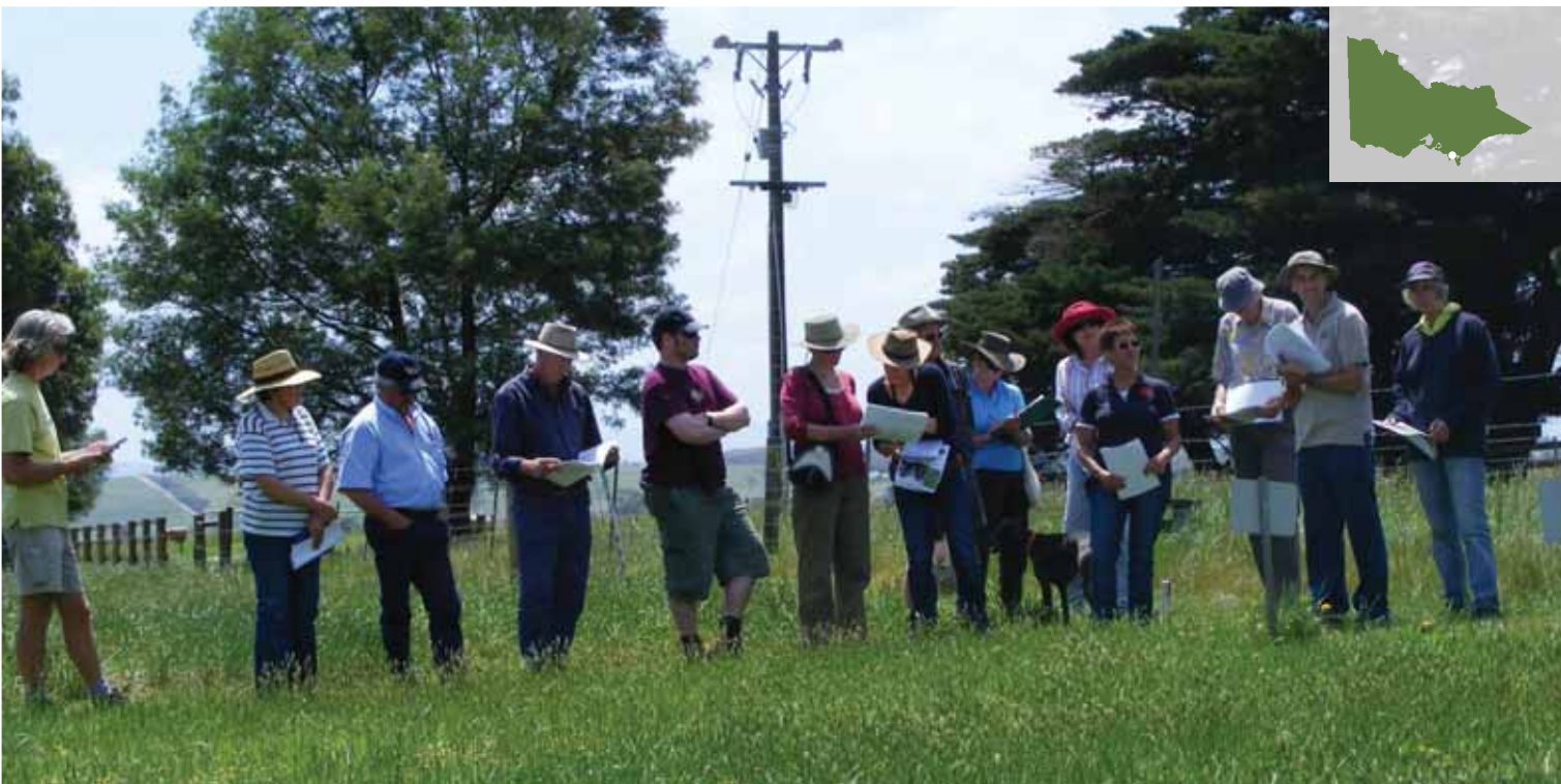
Farmers discuss the results of the soil trials. Early results show that different types of fertilisers have a significant impact on soil biology.