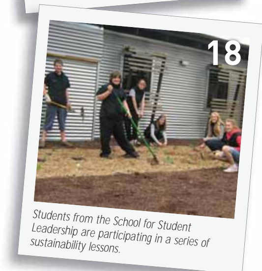
Students from the School for Student Leadership are participating in a series of sustainability lessons.