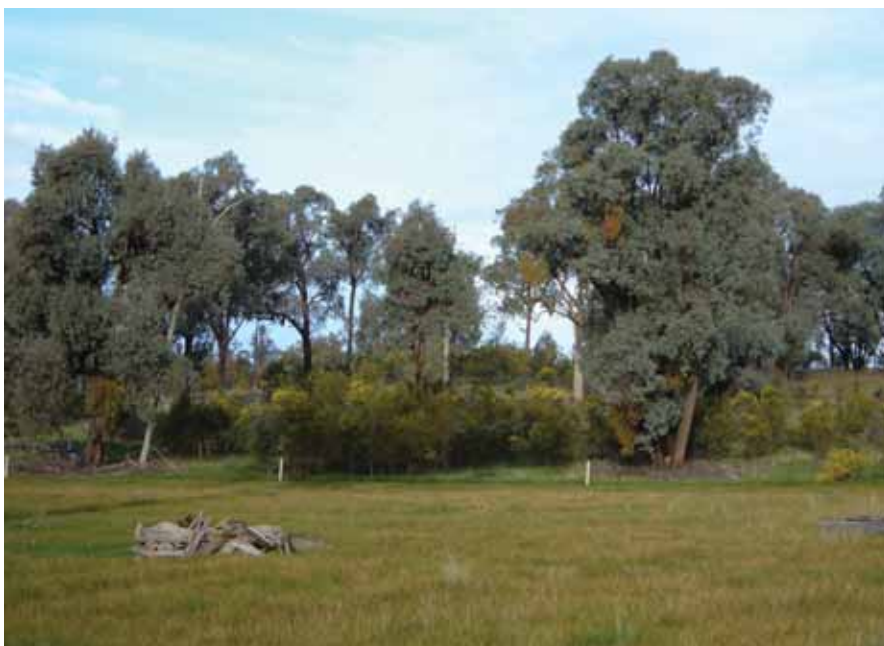
Mistletoe vine site six years later. Note the healthy trees and well-developed understorey.

In a healthy forest setting there are also a large number of birds that eat mistletoe fruits and drop the seeds randomly on the forest floor where they can't grow. The lack of protective understorey shrubs in open farmland means most of these birds are no longer present. The hardy little mistletoe bird is without competition and is able to spread the seeds precisely, placing their droppings only on the tree branches where the seeds will grow. Once again the mistletoe is advantaged.