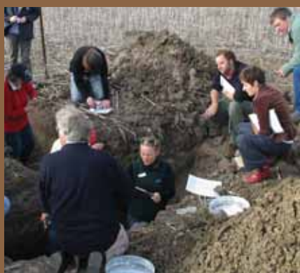
New soil health information now available on the VRO website was collected for a series of workshops and field days like this soil pit training exercise held at Dunkeld.

The soil health section can be found at: http://www.dpi.vic.gov.au/vro/soilhealth