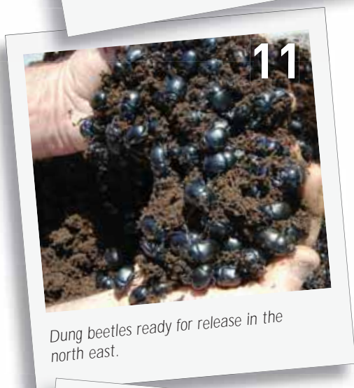
Dung beetles ready for release in the north east.