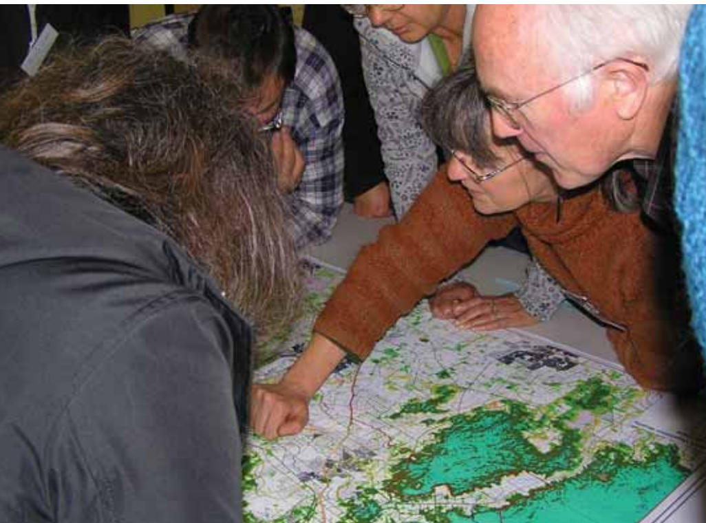
The more heads the better. Members of the Jacksons Creek EcoNetwork plan their future projects.