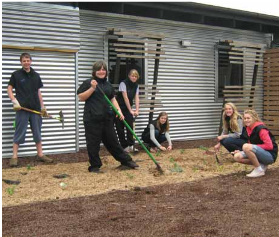
Students from the School for Student Leadership are participating in a series of sustainability lessons thanks to assistance from the Heytesbury District Landcare Network's craters to coast alliance.