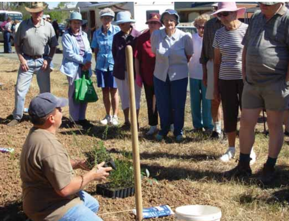
The Echuca Landcare Group involved parishioners from the Echuca Moama Uniting Church in a planting day at Echuca.