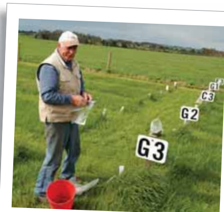
Soil tests are carried out on one of the six farms in the Westernport catchment involved in the healthy soils, stock and pasture project.