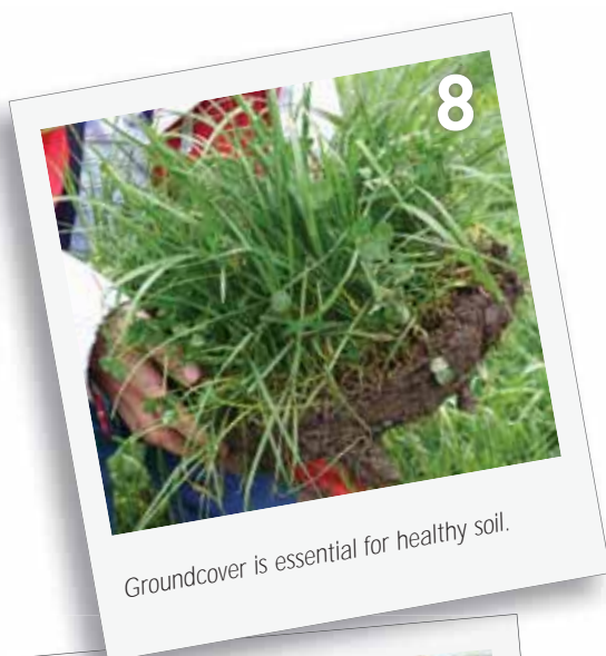
Groundcover is essential for healthy soil.

The State of Victoria acknowledges contributions made by private enterprise and other persons or groups interested in Landcare. Acceptance of these contributions, however, does not endorse or imply endorsement by the State of Victoria of any product, service, or view offered by contributors.