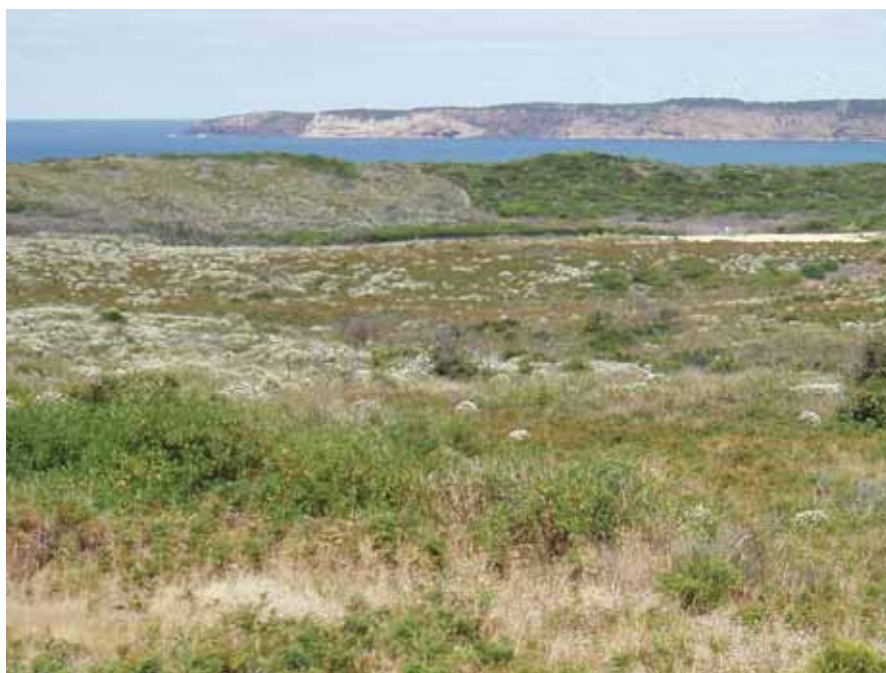
The site in January 2010, two years after the ecological burn. The white flower is the vulnerable Sand Ixodia.