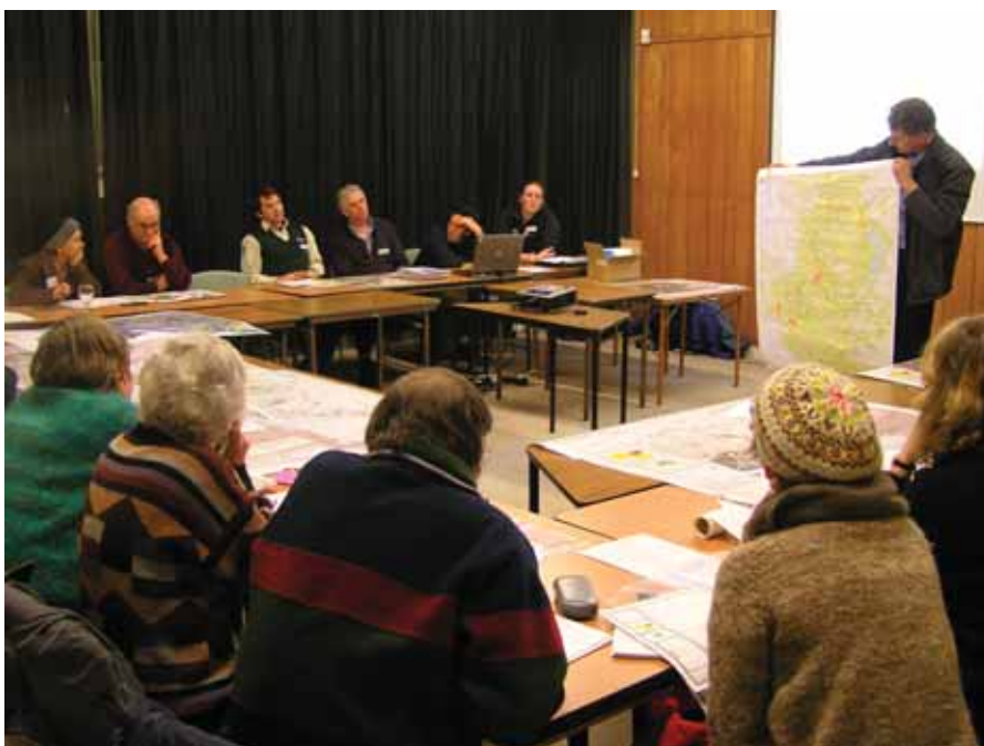
A landscape scale planning session for the Yarra Valley and Dandenong Ranges Landcare Network – an opportunity to see the big picture.

Members of the network management committee must be clear that their role is to manage the network, not to push the interests of their individual local groups.