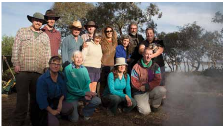
Walkers assembled at Lake Bolac at the start of the 2014 Healing Walk.

The healing walk contributes to the aims of the Eel Festival which are to be a gathering place for people who care for