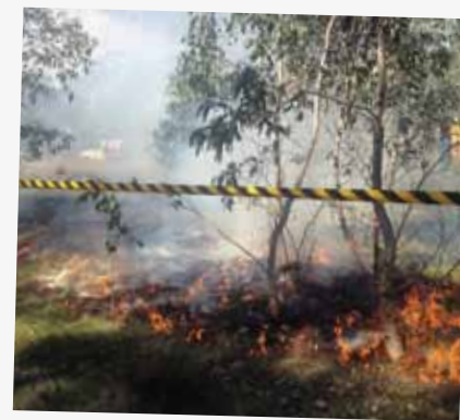
A trial fire plot being burnt in May 2014.