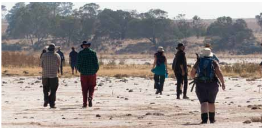
Walkers at Chinamans Swamp, a wetland near Westmere, on the 2014 walk.

In 2014, in keeping with the festival theme of return to country the twilight celebration examined the war service of Indigenous servicemen and women.