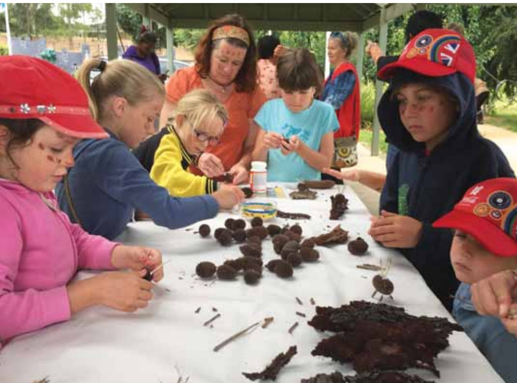
Children learn how to make echidnas as part of summer holiday activities along the Avon River at Stratford.