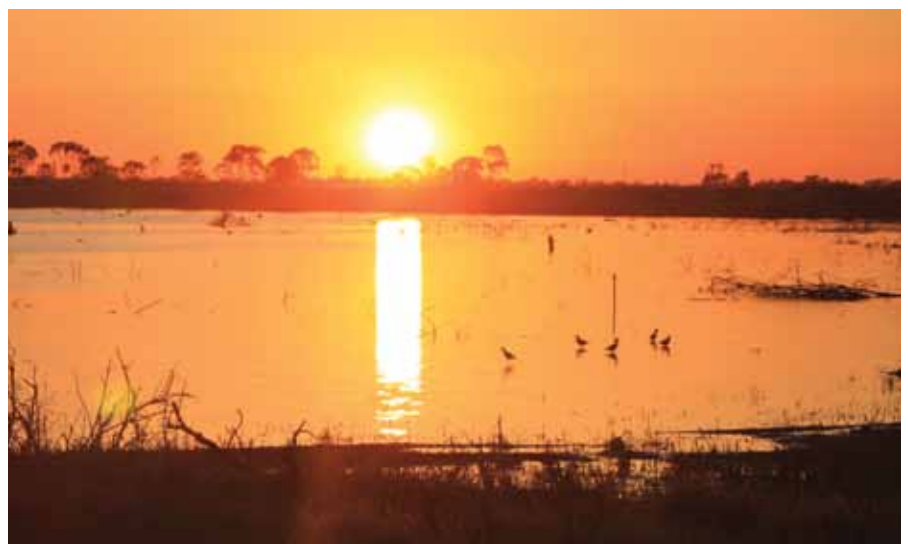
North central Landcarers enjoyed a breakfast with the birds event at Lake Murphy.