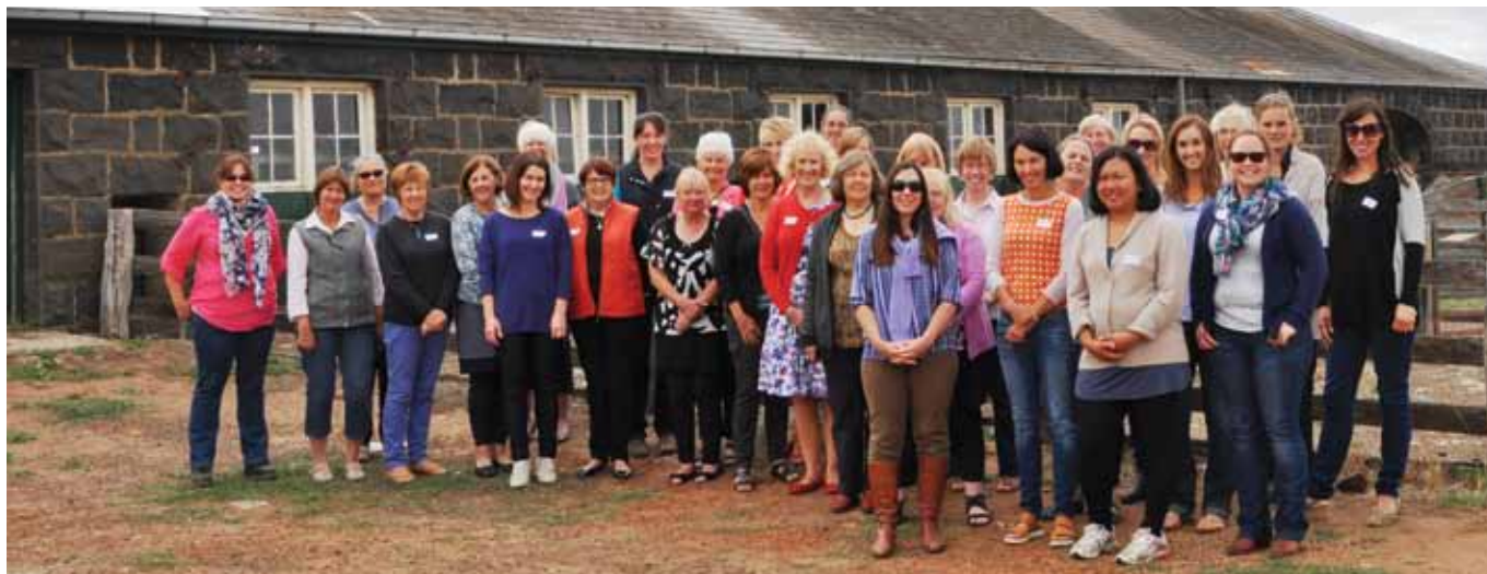
The Corangamite Rural Women's Network met at the Warrambeen Landcare Centre in February.