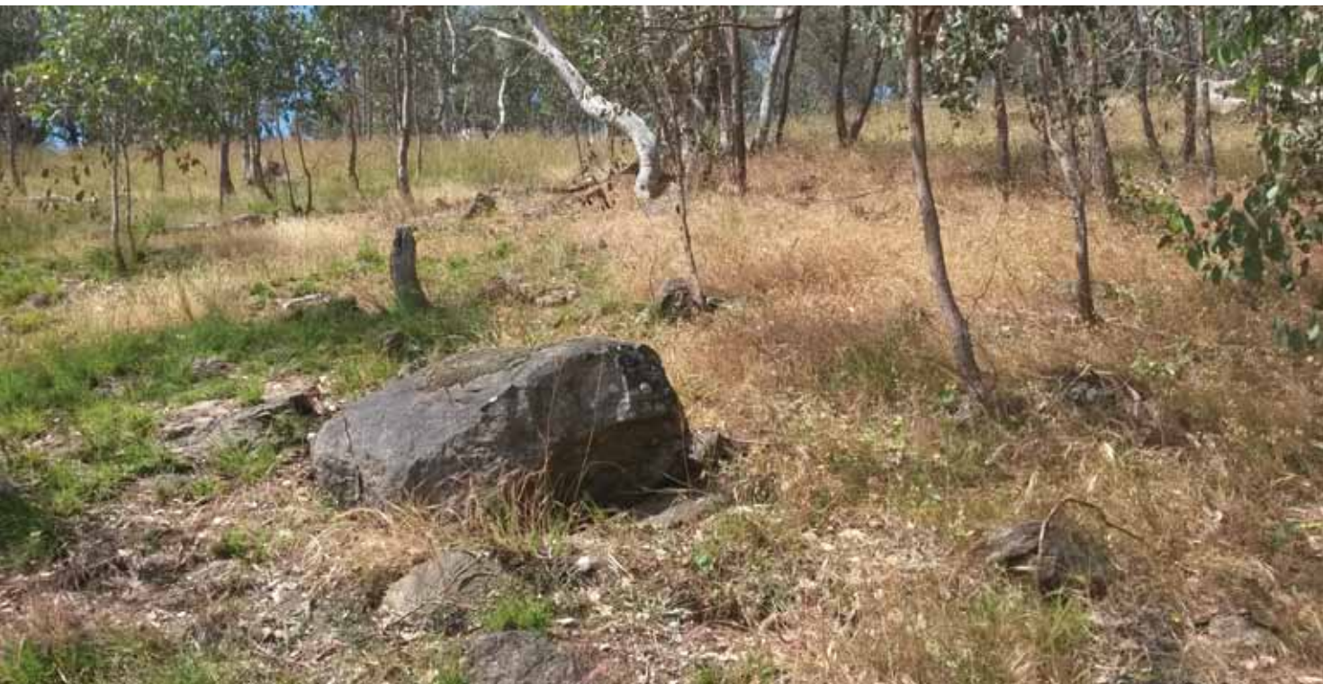
Native grass regrowth after fire compared to unburnt dry grass (at right).