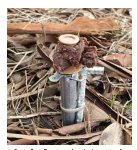
A Canid Pest Ejector with dehydrated beef lure at St Helens Flora Reserve.

The CPEs have been very successful. Foxes do not learn to evade the CPEs and there is no sub-lethal dose or caching of baits – a strong consideration in a farming district when the neighbours all have working dogs. At one CPE we filmed I checked the site every six days and we removed four juvenile foxes over one month. One CPE with an unchanged meat bait attracted possums, wallabies, birds and reptiles but remained untriggered until a fox activated it after three months. No buried bait would survive that long.