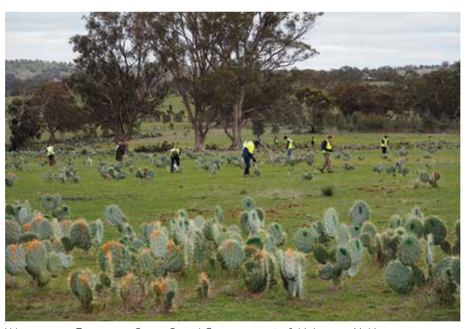
Volunteers at a Tarrangower Cactus Control Group community field day near Maldon treat an infestation of wheel cactus plants by direct injection of herbicide.

Many Landcare groups benefitted from the Working for Victoria Environmental and Agricultural Work Crews that assisted on dozens of sites across the region clearing woody weeds and planting projects.