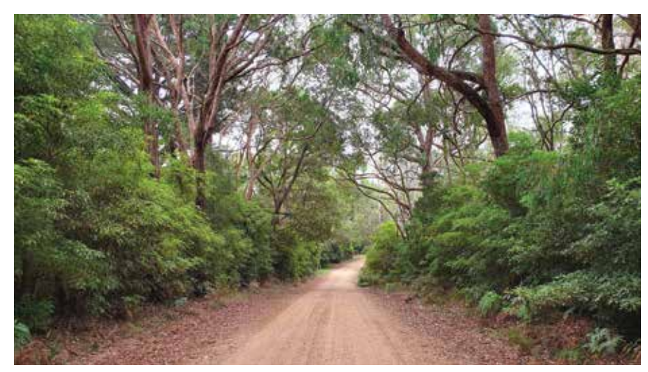
Before: Blacks Road near Portland had been infested with sweet pittosporum for many years.

SEA provides a platform for networking and producing media content for the catchment that benefits all the environmental groups who are working together to create positive environmental change. Together we have developed and maintained some great partnerships and are always looking for opportunities to work with new groups and organisations.