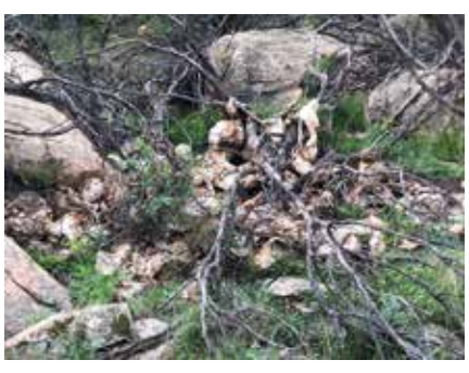
The same cactus ten months after treatment.

The next stage of the project will be to begin retracing our steps with hoes and buckets to pick up any cacti germinants