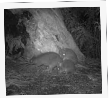
Endangered long-footed potoroos are benefitting from the expansion of the Southern Ark.

A key support tool for this planning was Strategic Management Prospects (SMP). SMP is a publicly available tool developed by DELWP that helps identify what actions to do and where to do them, based on the greatest benefit to the most species at the least cost.