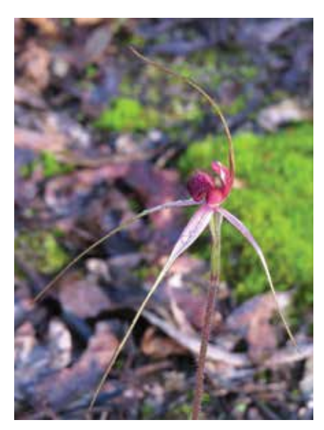
The wine-lipped spider orchid is making a comeback on the co-op.

Round the Bend Conservation Co-operative was established in 1971 by a group of residents who live on a 132-hectare property at the Bend of Islands, north east of Melbourne. We are interested in preserving the natural environment through residential conservation, which aims to reduce and contain the impact of our living in the bush.