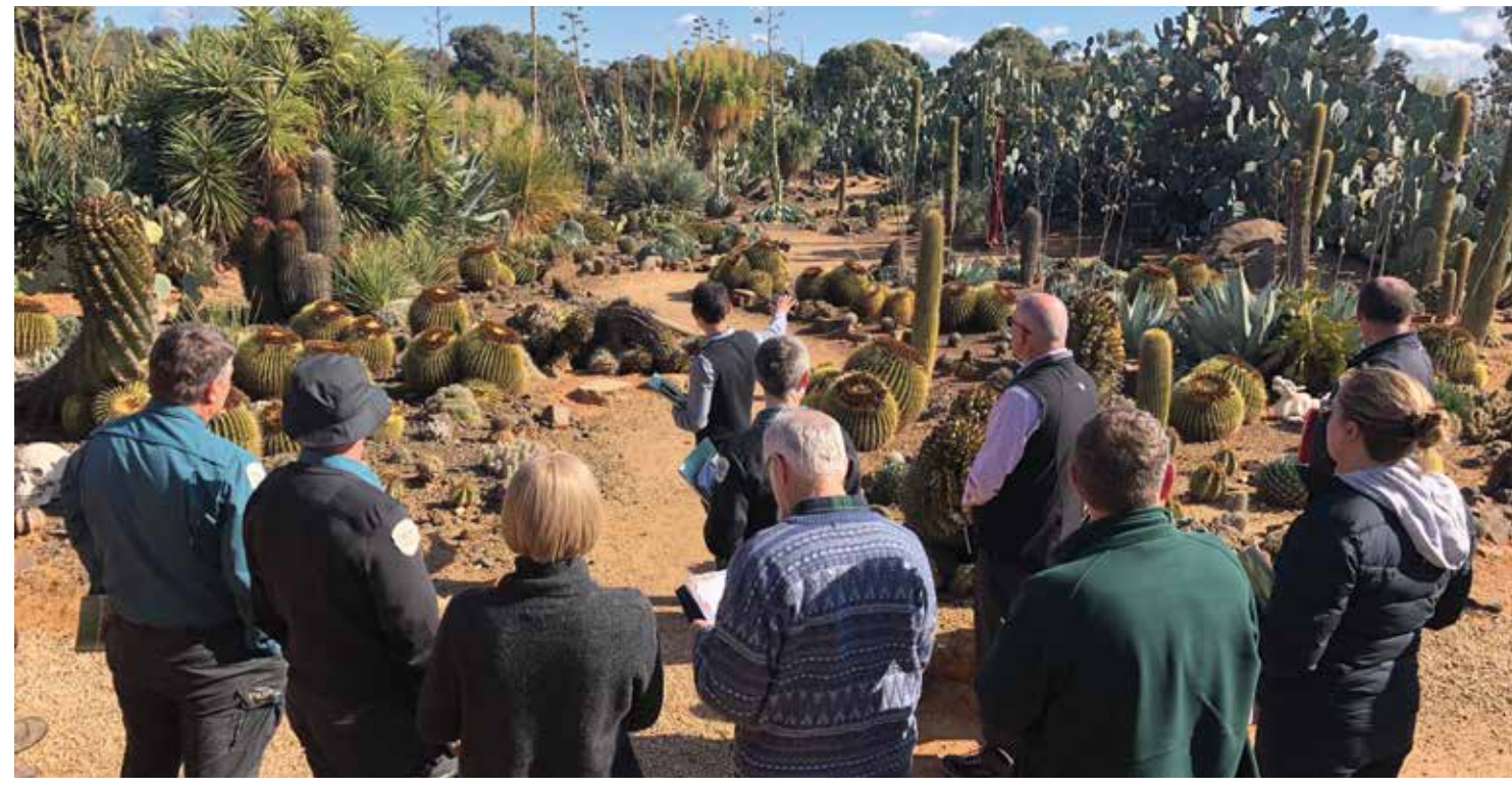
An invasive cacti identification workshop coordinated by the WESI Team at Cactus Country, Strathmerton in 2019.