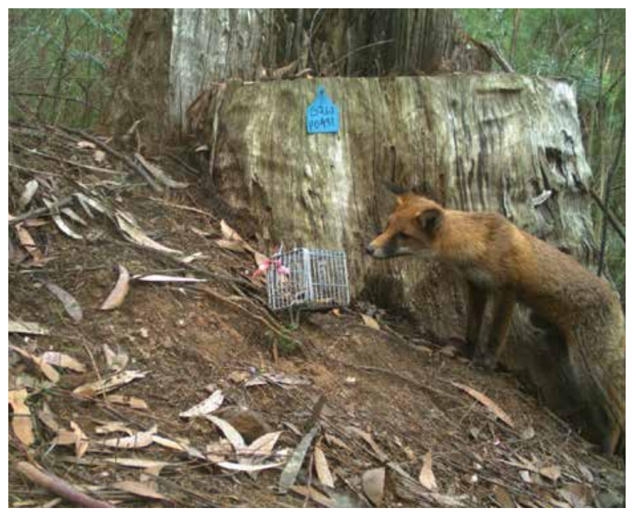
A fox checks out a lure at a trapping site in the Club Terrace State Forest near Cann River.

In the case of the Southern Ark expansion using SMP reassured program managers that delivering fox control in the newly identified areas would provide the most benefit to native species after the fires.