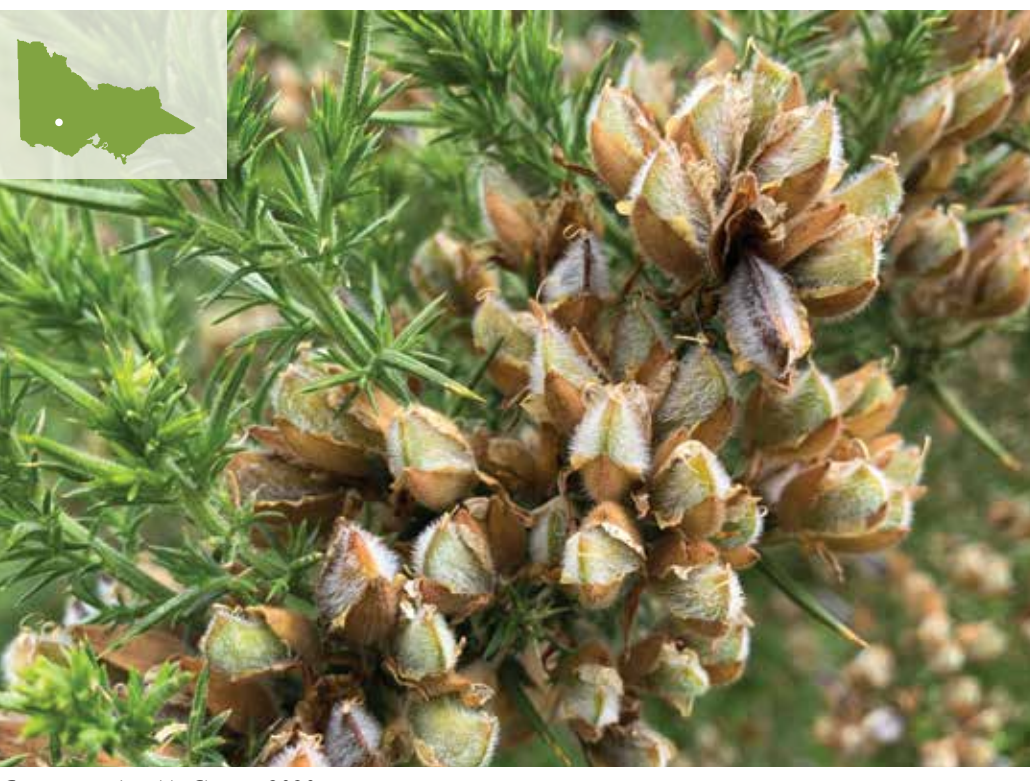
Gorse in seed at Mt Clear in 2020.