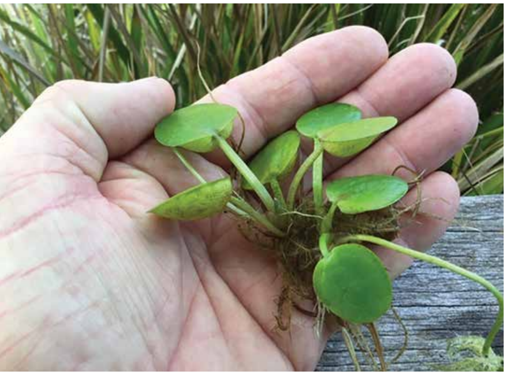
A serious threat to wetlands and waterbodies, floating aquatic pond plant Amazon frogbit (Limnobium laevigatum) in Gippsland, February 2020.

The very fine seeds of SAWO can be blown kilometres by the wind and are easily spread by machinery, vehicles, and on footwear.