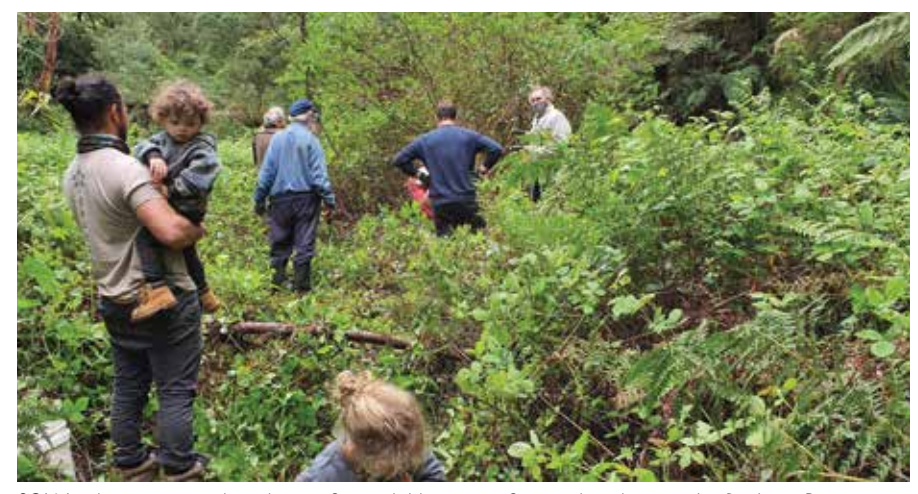
SOLN volunteers attack a clump of tree dahlia at our first working bee on the Barham River, near Apollo Bay.

Late last year, while cycling home after work, I got chatting with a local landholder who was concerned about the spread of weeds. According to Greg Ware, the tree dahlia had spread more than a kilometre in the past five years. I suggested a monthly working bee and Greg jumped at the idea.