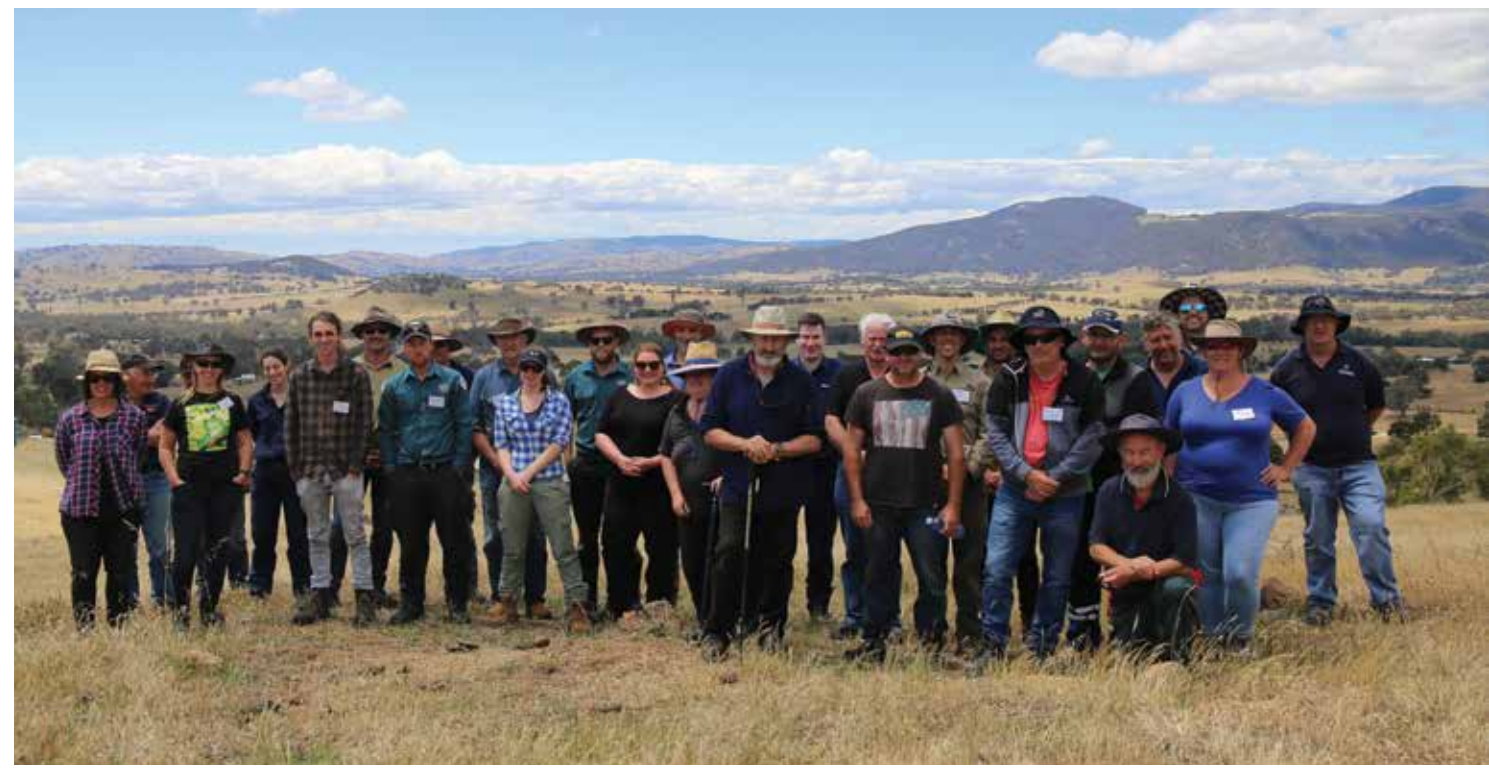
A group of upcoming rabbit control leaders in the field at Euroa in 2018.