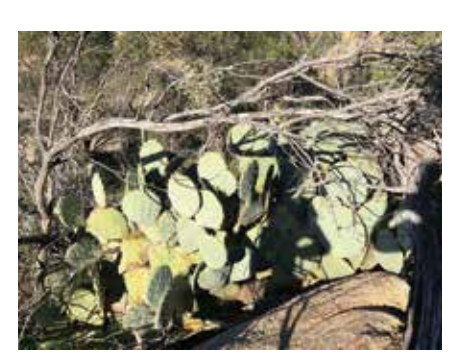
Wheel cactus on Mt Korong before injection.

After our initial working bee in 2018 we had three in 2019 and three in 2020. Between three and 10 workers turn up and we usually manage to cover the day's target area. Participants walk in line-search style, with one person marking our leading edge using GPS tracking. That way we can document the extent of areas treated.