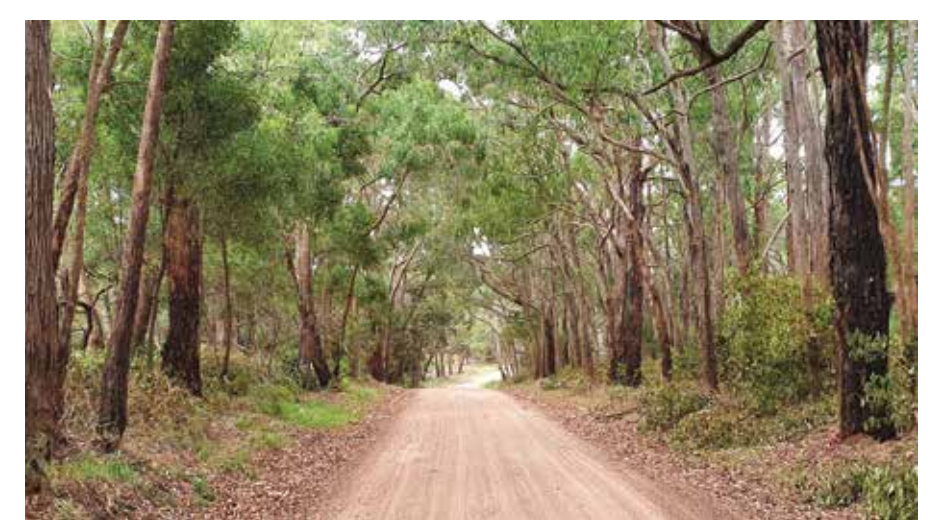
After: Blacks Road Portland after the Southwest Woody Weed Action Team clean up in 2021. Dramatic improvements in roadside character have motivated many new members to join the group.

The rapid rate at which pest plants are marching down the highways and through the back roads of our farmland and on towards our greatest assets can feel overwhelming.