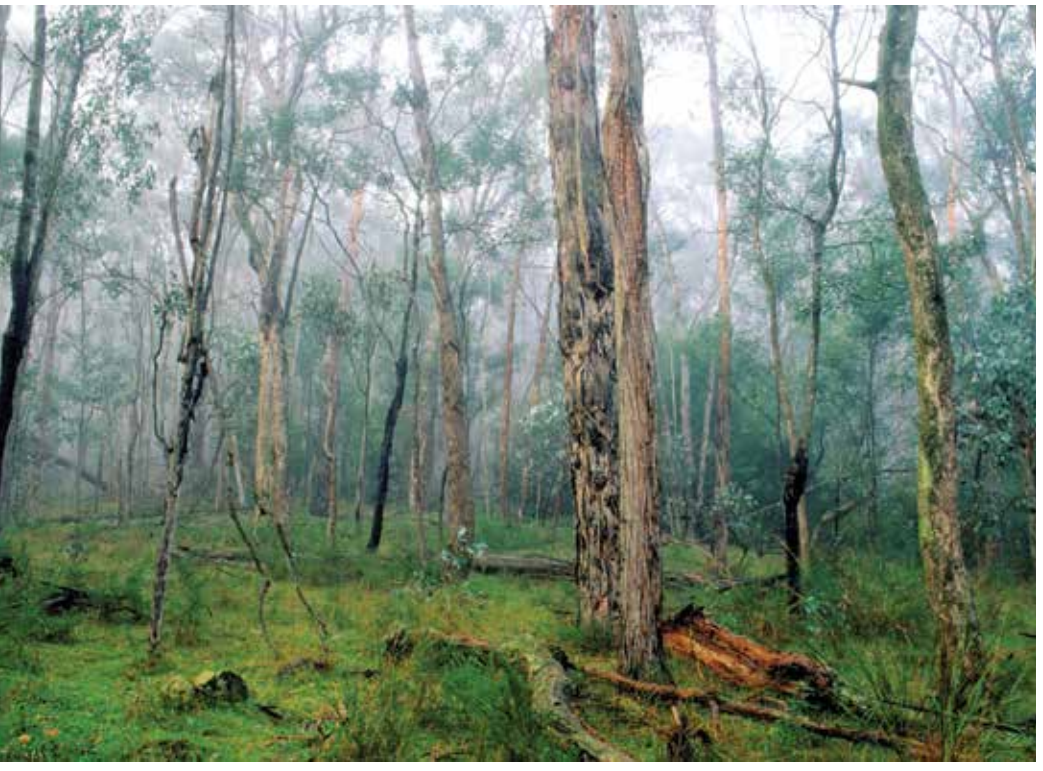
The property supports diverse flora and fauna including the endangered brush-tailed phascogale.

In fact our biggest challenge was making sure we got all residents on board with such a long-term program of weeding.