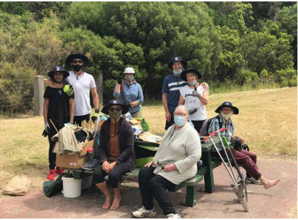
A Portland Coastal Cliffs Incorporated planting day held in November 2020.

All the successful weed warrior groups and projects in south west Victoria demonstrate strong leadership and good communication skills.