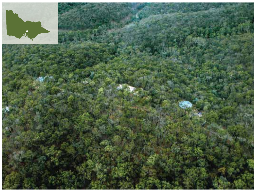
An aerial view of the Round the Bend Conservation Co-operative.