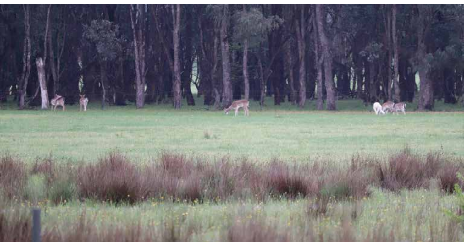
A herd of fallow deer seen regularly on private land opposite an aged-care facility at Baranduda, 10 kilometres from Wodonga.

Each carcase earns the landholder a small return. Harvesters are currently earning $1.90 to $2.50 a kilogram with landholders receiving $0.50 per kilogram depending on the processor being used. The average processed weight of a carcase is 86 kilograms.