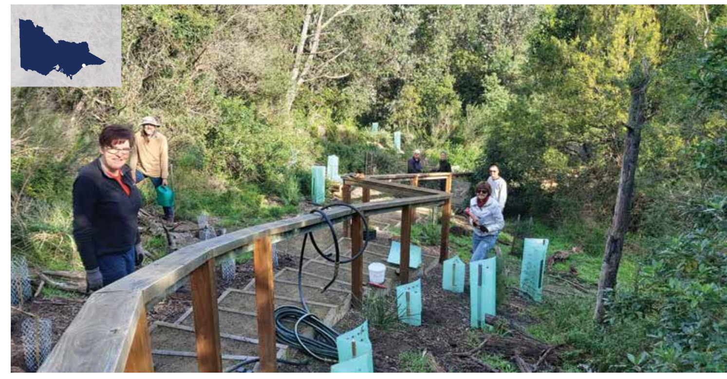
A working bee on the 100 steps in June 2020 provided a good physical workout for TBLC members.