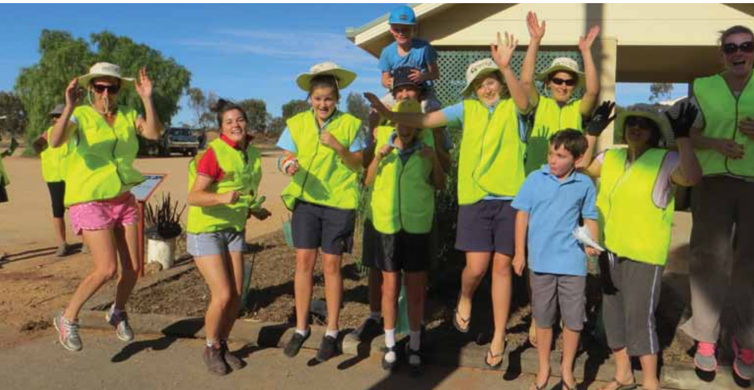
Manangatang community members celebrate after a successful tree planting at the local rest stop.

and non-government agencies. This has been very important when groups are undertaking pest plant and animal control projects. A major achievement has been the control of pest rabbit populations which are a major threat to viable agricultural land and flora and fauna species in the Mallee.