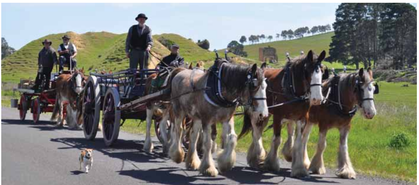
Wagons on their way to Smeaton to re-enact the delivery of produce from Clunes to Andersons Mill at Smeaton.

For further information about Victorian Landcare Grants go to your CMA website.