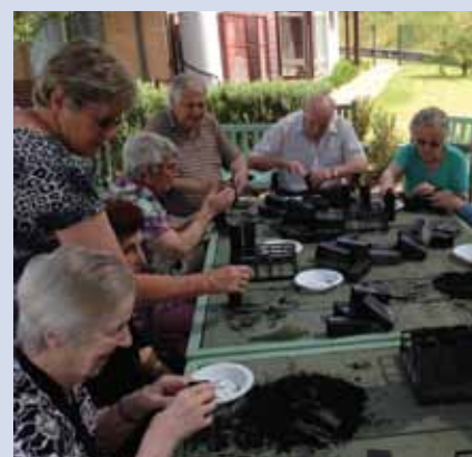
Residents of the Dianella Retirement Village at Kilmore sowing seed for South West Goulburn Landcare Network projects.

After the residents have sown the seed I take it home and look after it until the autumn break. Local landholders then prepare an area to receive the plants. The residents get feedback on where the plants have gone. We are also hoping to take some residents on a bus trip to an accessible site so they can see the benefits of their handiwork.