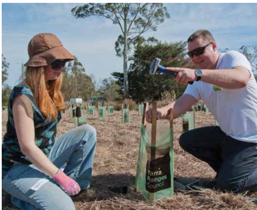
From little things, big things grow: a day of planting trees together can forge new friendships.