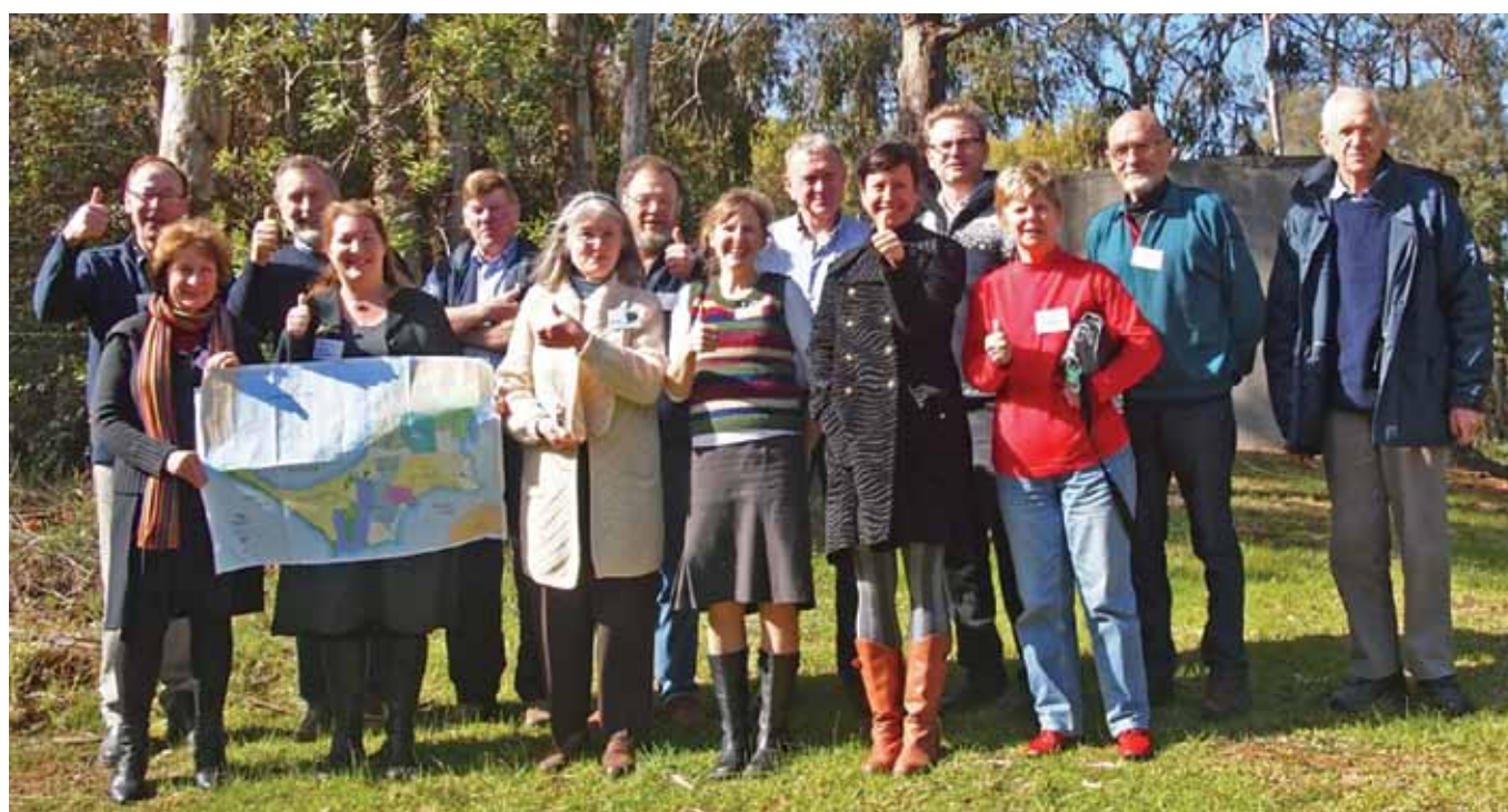
Landcare group representatives decide to form the Mornington Peninsula Landcare Network.

To my surprise, the first few grants we submitted were successful – four groups received funding for projects ranging from biolinks to farm forestry education and fauna monitoring. Having an interesting project to work on gives groups a boost and attracts more members.