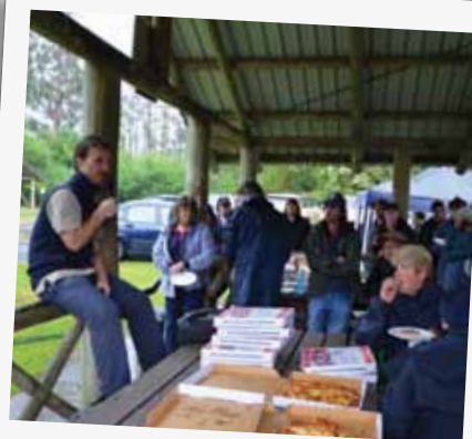
Jindivik Landcare Group members enjoying a pizza and platypus evening.

I've found that attracting people to Landcare is most successful when there is a broad range of activities on offer. For example, activities on biodiversity may attract a different audience to those on sustainable agriculture. Making the event social is also a good idea and free food is always popular.