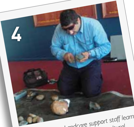
Goulburn Broken Landcare support staff learnt about tool making and identifying cultural heritage sites at a recent workshop.