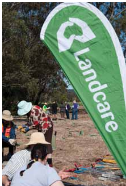
The Landcare Australia Limited online kit provides groups with all of the resources they need to run a successful Landcare for Singles event.

Facilitation can have many applications. In my role as a Landcare facilitator with the Yarra Ranges Landcare Network, amongst a suite of other tasks, I help to run a program that is aiming to recruit new volunteers to Landcare activities while offering them an opportunity to meet a potential life partner.