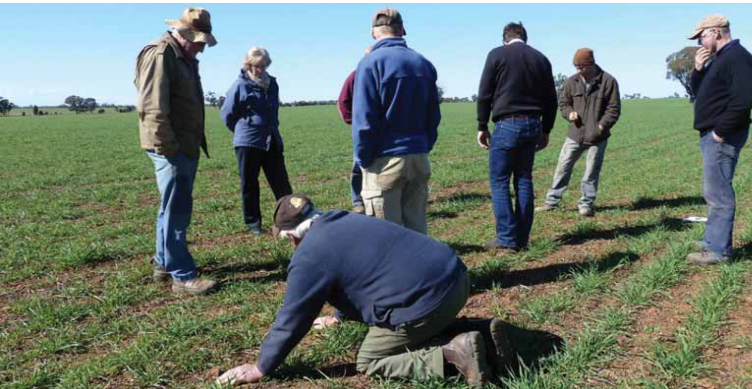
Mid Loddon Landcare Network members conduct a serious investigation of newly sown pasture at a cell grazing trial site.