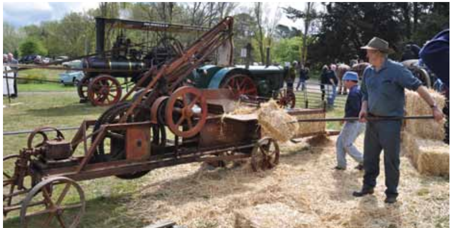
Old hay baler in operation at the 175-year celebrations at Smeaton.

the North Central CMA in 2013 helped to kick start the formation of Friends of Smeaton. The funds covered the group's initial incorporation and insurance costs and allowed them to focus on planning a celebration to mark Smeaton's 175 years of settlement.