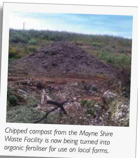
Chipped compost from the Moyne Shire Waste Facility is now being turned into organic fertiliser for use on local farms.