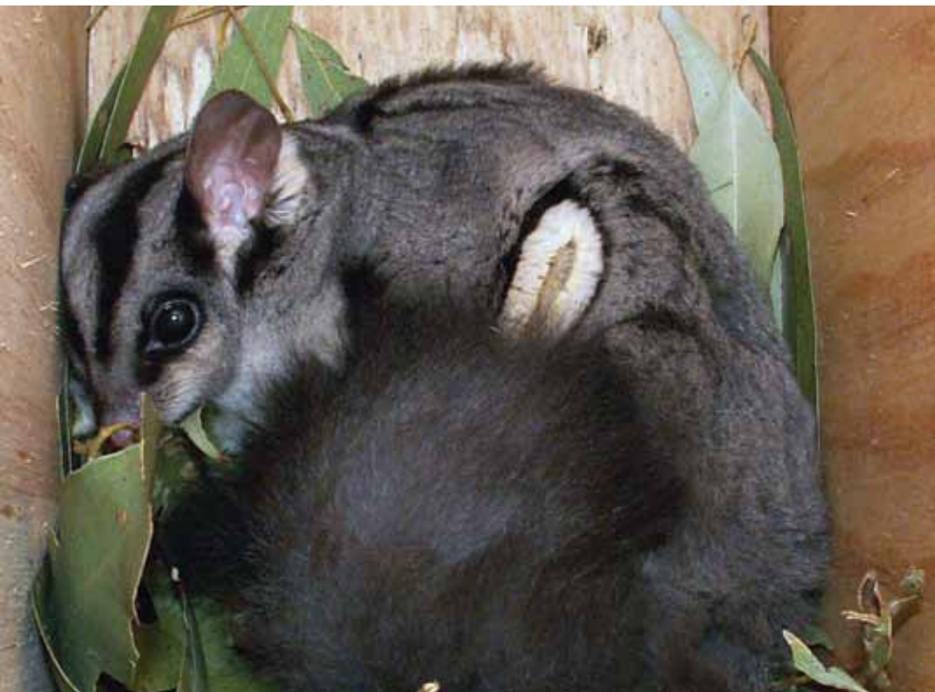
A squirrel glider taking a nap in a Landcare group nest box.