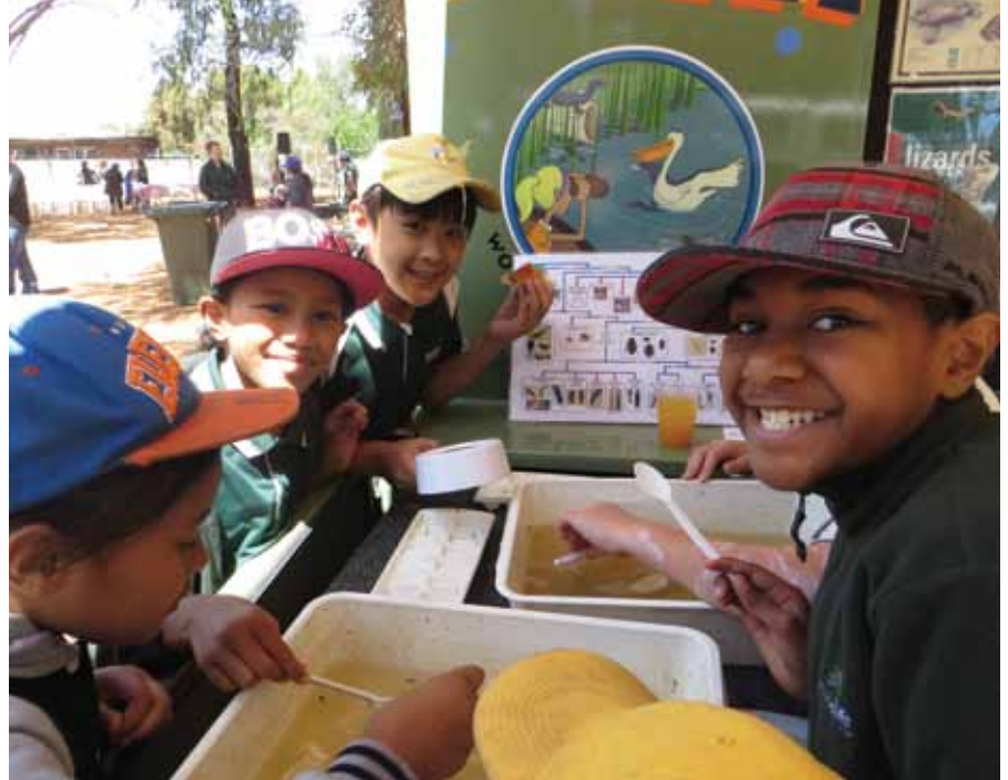
Robinvale P-12 students enjoying their community garden open day at Mallee CMA's Waterwatch trailer.

The day arrived. I was armed with my stack of paperwork and welcoming smile, but there were only four participants. I was perplexed about how to reach all of the groups and provide the support they needed.