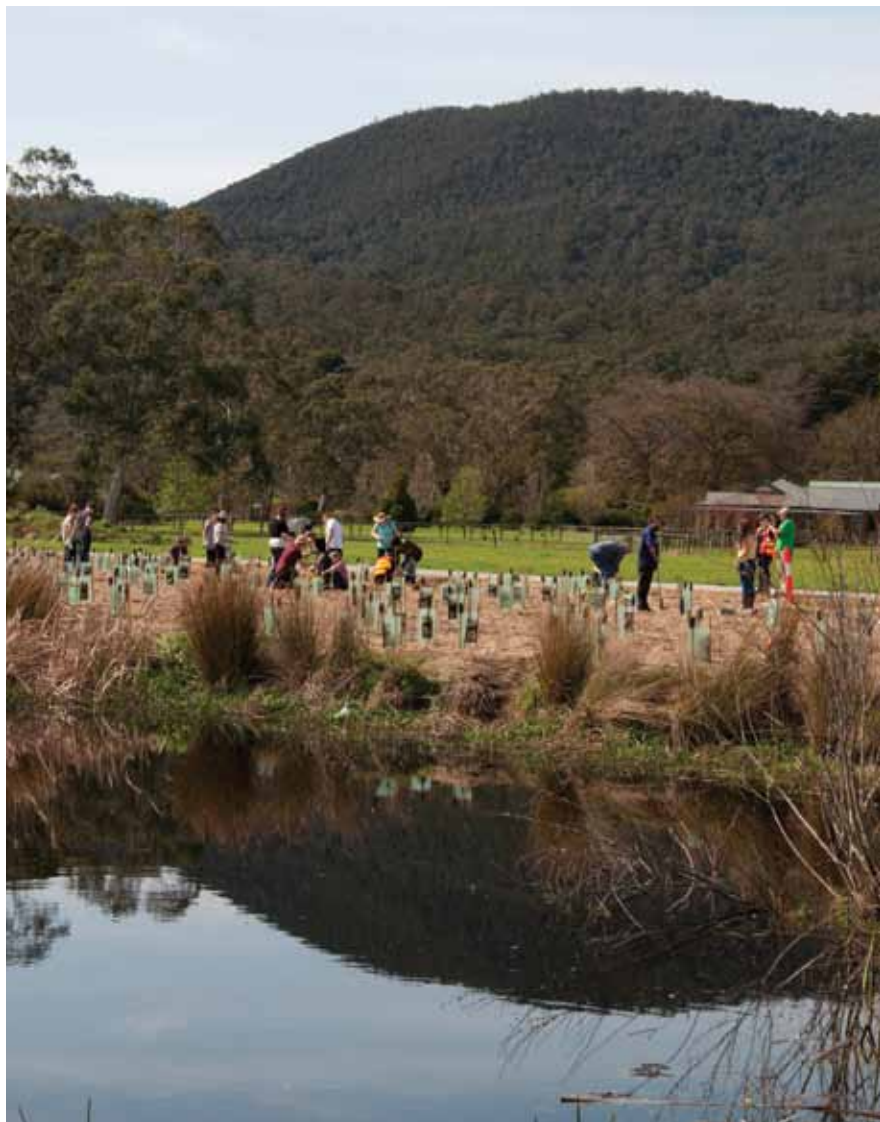
A Landcare for Singles event at Warburton last year.

After both of the 2013 events we surveyed participants to obtain feedback. Twenty-four people responded to the survey after the Wesburn event. More than 85 per cent of respondents rated the event as excellent or very good and 76 per cent of respondents said they would recommend a similar event to a friend. Eight respondents said they would look into joining a Landcare group.