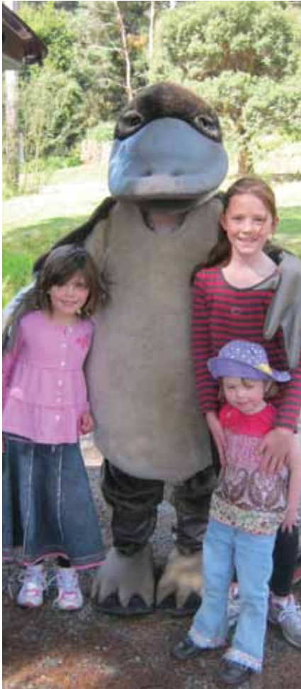
The Cardinia Creek Landcare Group has been active in trying to improve the health of the Cardinia Creek Catchment for the platypus.

UFWMI Plus, the aim is to carry out works on private land to complement the weed control works that are underway on public land.