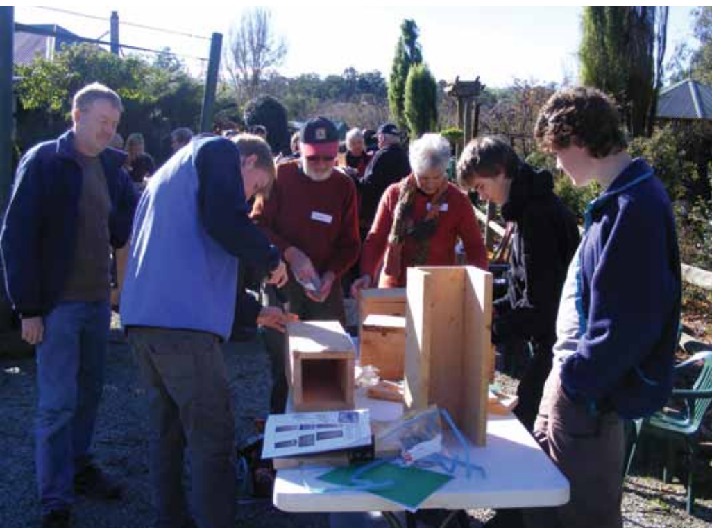
Nest box building with Neerim and District Landcare Group.