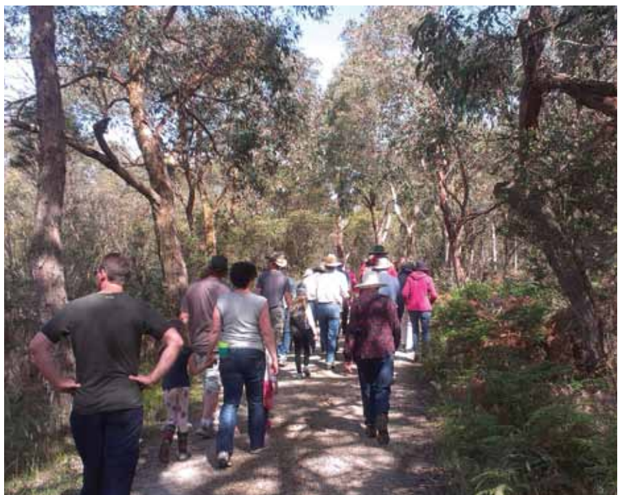
A well-attended tour on restoring bushland and wetlands.