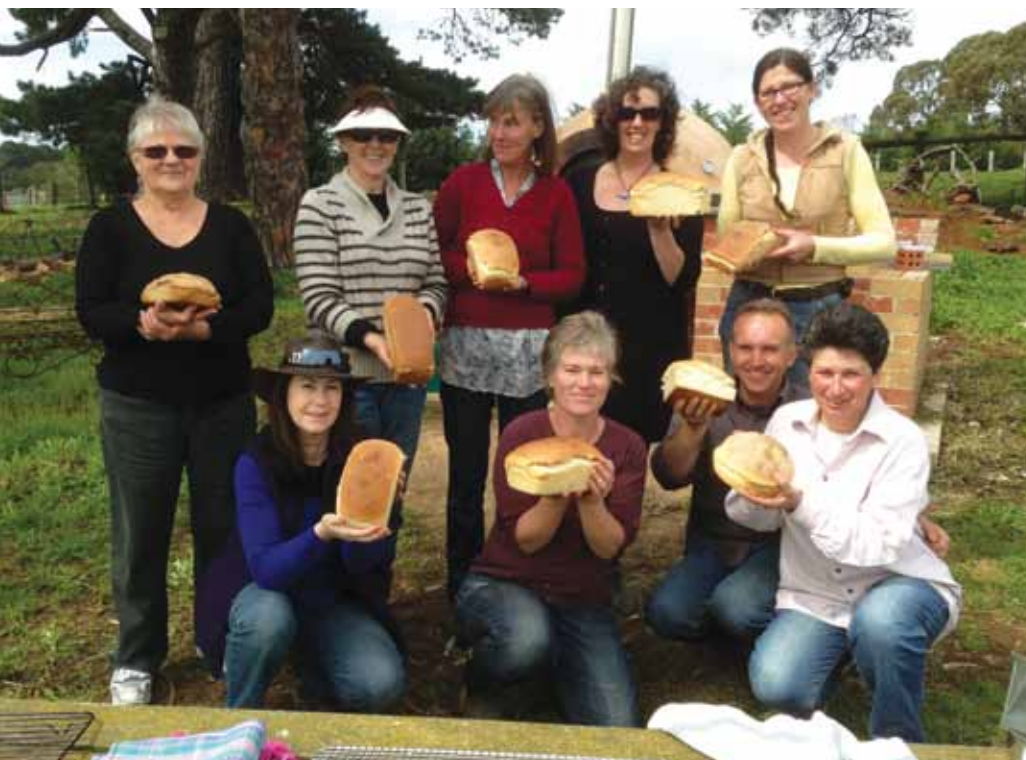
A workshop on making sourdough bread is a way of extending the Landcare concept and introducing it to a new range of people.