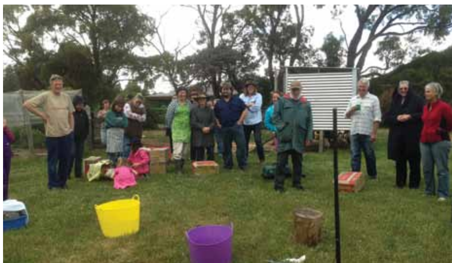
A workshop on keeping chooks for eggs and meat helps to forge links between people in the community.

Finding volunteers and fostering partnerships for planting projects is a large part of the job, especially leading up to the autumn break and planting season. Creating partnerships with