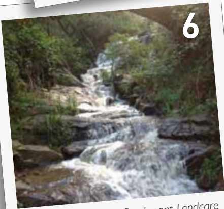
The Sheepwash Creek Catchment Landcare Group has recently been formed in a drive to improve the health of the creek.