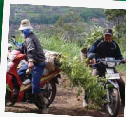
Motorbikes transport seedlings for food and erosion control to steep mountain areas in central Sumatra, Indonesia.

For further information go to www.australianlandcareinternational.com or email Rob Youl at robmyoul@gmail.com