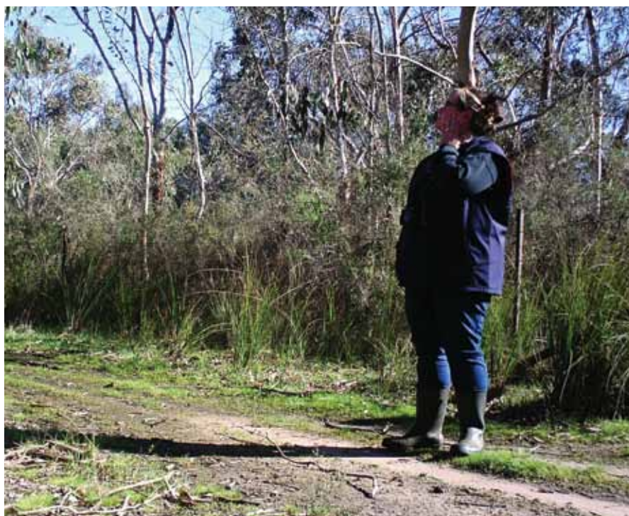
Lisette Mill contemplates the many forms that facilitation can take in the bush at St Helens.