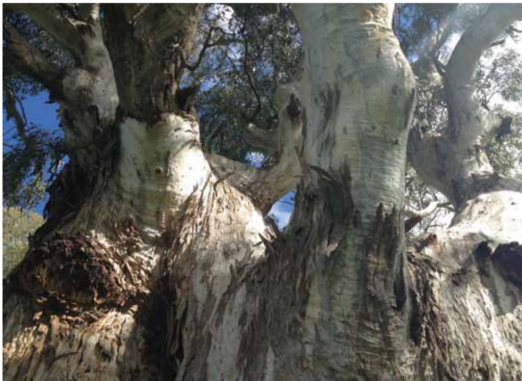
This mighty river red gum with a trunk circumference of 980 centimetres won the BIG tree competition.