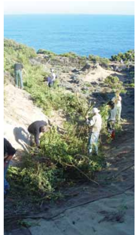
Friends of the Great South West Walk work with students from Wesley College spreading Coast Wattle to help stop erosion.

Friends of the Great South West Walk run regular guided walks along different sections of the track as well as one supported walk every year where walkers can tackle the whole 250-kilometre track.