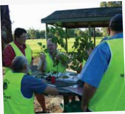
The Friends of Willow Park at a weed identification field day in the park.

The group's vision for the park is an urban bushland loved and enjoyed by all in the community – they are well on the way to achieving that.