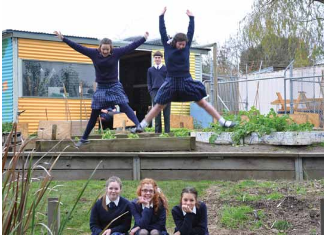
Ballarat Christian College students in front of their organic vegetable gardens.