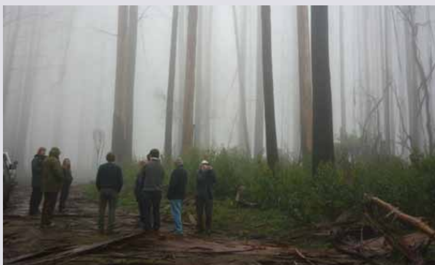
Members of the Nillumbik Shire Council Natural Environment Recovery Working Group observe the regeneration at Kinglake National Park 18 months after the Black Saturday bushfire.

The Natural Environment Recovery Working Group has been the focal point in delivering bushfire recovery assistance to landholders in the Shire of Nillumbik and the very high uptake of the support offered is an indication of its success.