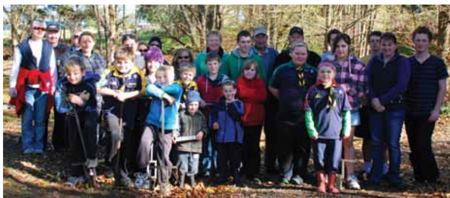
Cobden Scouts help to plant over 800 native plants at Corangamite's Cobden Lake in June this year.

Landcare projects are always underway. The council works with businesses, neighbouring councils, schools and