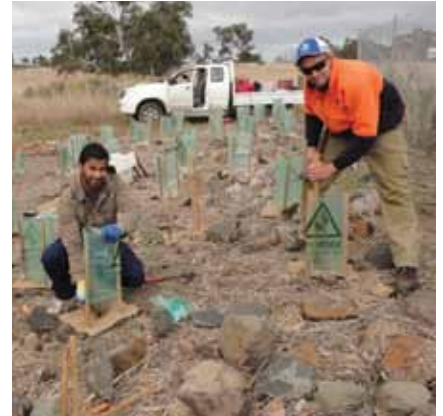
The Friends of Merri Creek during a planting day at the Cooper Street grasslands (Bababi Marning) in Campbellfield.

More than 70,000 indigenous plants have been planted by the group since 2000. Over the last seven years they have held more than 300 different activities involving 3400 volunteers.