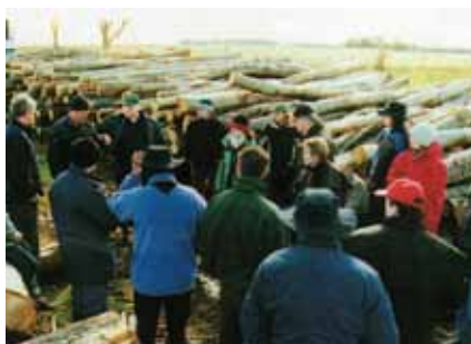
2004. A group of Master Treegrowers learn how sugar gums can be managed to provide sawn timber and fuelwood supplies.

The Camperdown College Environment Group propagates indigenous plants for restoration projects at Mt Leura and Mt Sugarloaf. The group has also created bush-tucker gardens, established an environment education centre and organised a national wetlands conference which attracted 150 students from across Australia.