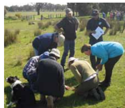
Farmers inspect a trial plot at an introduction to pasture cropping field day at Avenel.

New developments in the project include a focus on grazing as a management tool and improving local knowledge of native grasses.