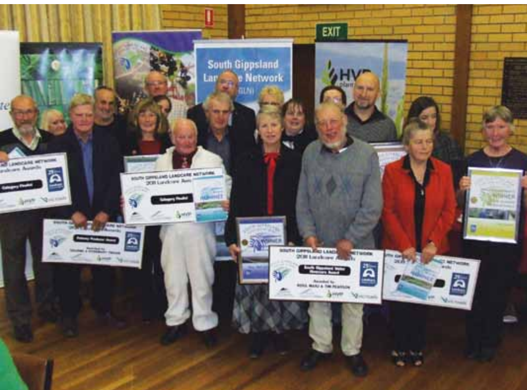
Proud winners at the 2011 South Gippsland local Landcare Network Awards.