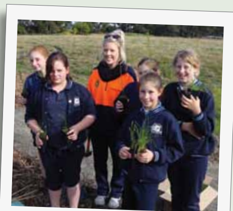
Longwarry Primary School students helped with the fire recovery effort on National Tree Day.

Following the fires there was an inundation of weeds across the affected area. The council also worked in partnership with other agencies to educate, train, equip and support landholders to successfully treat the weed outbreak.