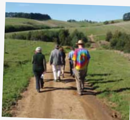
A farm walk during the West Gippsland CMA's Landcare Week activities.