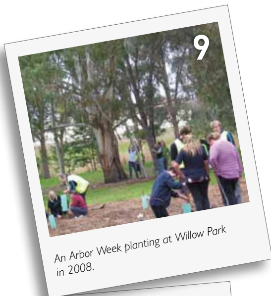
An Arbor Week planting at Willow Park in 2008.