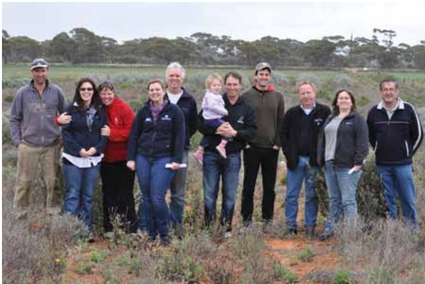
Members of the Millewa Carwarp Landcare Group met with the State Landcare team at a trial site near Werrimull recently to look at the grazing potential of locally indigenous plants on low productive soils.