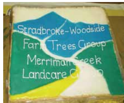
In July 2011 Stradbroke Hall is decorated with wattle, banksia, callistemon and hakea blooms for an anniversary event celebrating the Merriman Creek Landcare Group's 26th birthday.

More than 1200 Landcare, Coast Action/Coastcare, Conservation Management Networks and friends groups are operating in Victoria. Sixty-two Landcare networks provide an umbrella organisation for many of Victoria's Landcare groups. A Victorian Landcare Conference celebrates the 25th anniversary of Landcare.