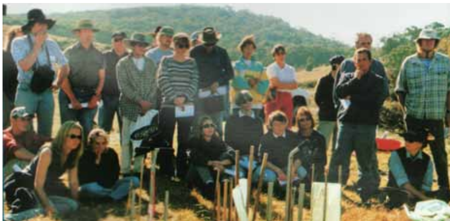
City dwellers from Ballarat joined their rural neighbours from the Leigh Catchment Group for a series of field days in 2001.

First International Landcare Conference held in Melbourne.