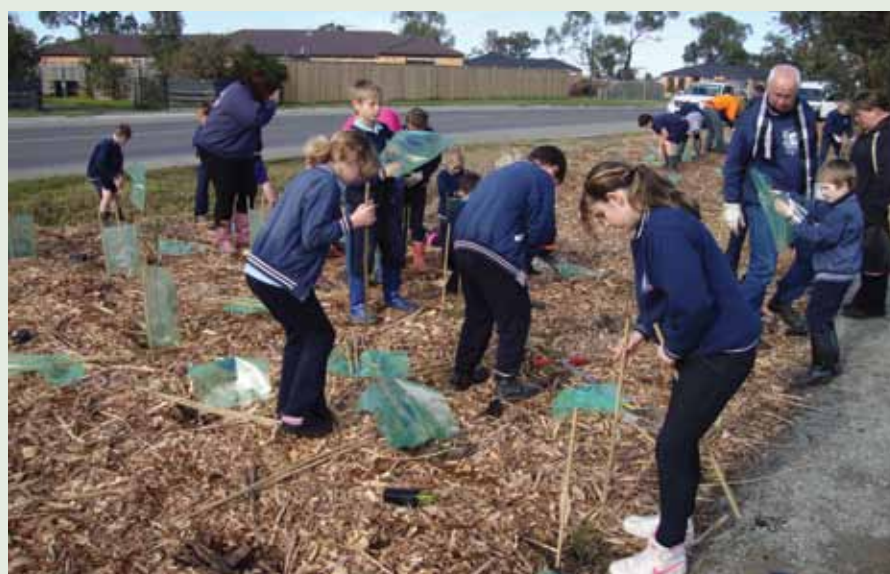
Students from Marist Sion College work on the Bandicoot walking track – a Baw Baw Shire Council fire recovery project.

The project saw walking tracks, bridges, picnic grounds, signage, car parks and