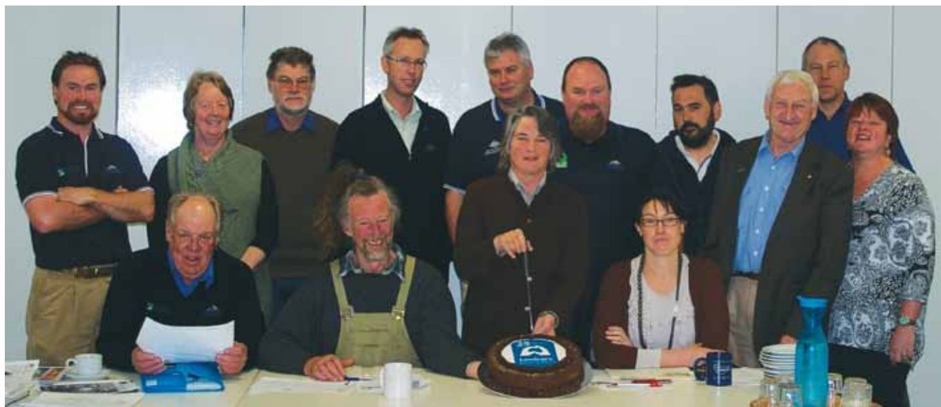
Representatives from the Bass Coast Landcare Network, Latrobe Catchment Landcare Network, Maffra & District Landcare Network, South Gippsland Landcare Network and Yarram Yarram Landcare Network with West Gippsland CMA board members and staff celebrating 25 years of Landcare at a recent Regional Landcare Forum.

The Chief Executive of the CMA meets regularly with the chairs of the five Landcare networks to discuss issues of concern and ensure the continued success and viability of Landcare. The CMA is a good example of the West Gippsland Landcare motto – Landcare is for everyone!