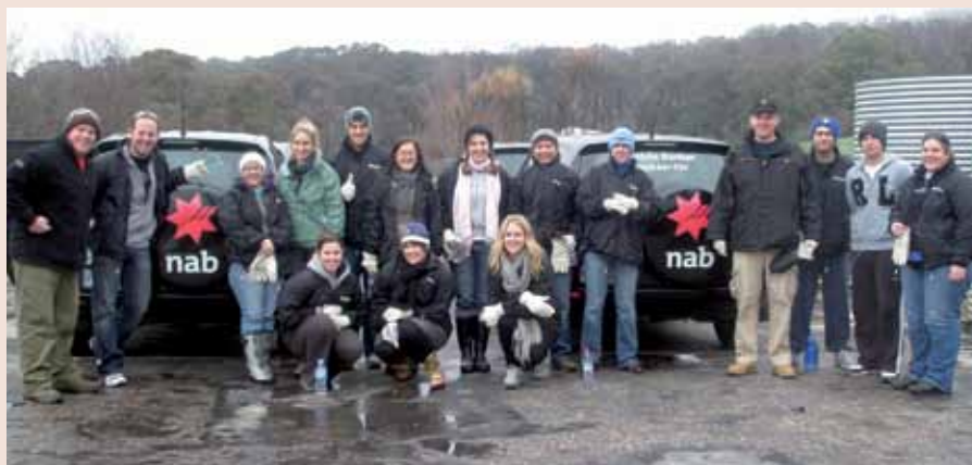
Volunteers from National Australia Bank braved cold and wet conditions to work on environmental recovery projects organised by the Upper Goulburn Landcare Network.

The network swung into action co-ordinating 3310 volunteers from businesses, community groups, service clubs and concerned individuals. The volunteers were equipped with protective clothing, trained in the safe use of tools and