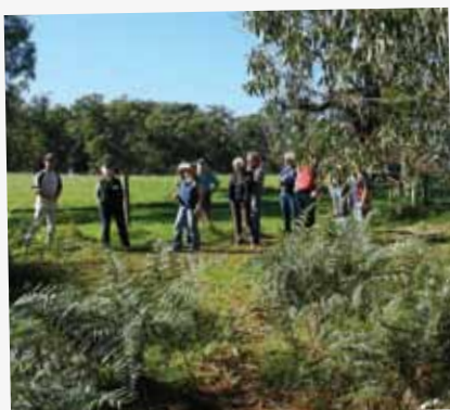
A remnant protection field day at Koonwarra.

The SGLN staff credit the many dedicated volunteers who undertake the on-ground work with making the network so successful. The strength of the network is also evident in the number of organisations who continue to support it and the range of new partners who have joined in recent years.