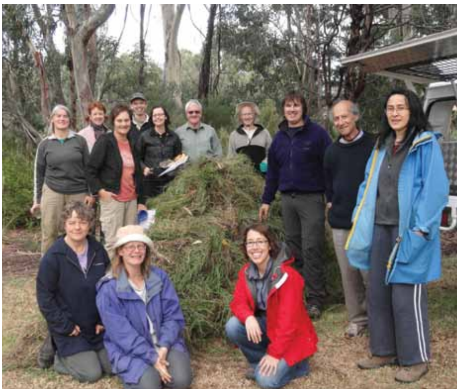
The Friends of Merri Creek show the results after a day of weeding at the Strettle Wetlands.

A survey of Growling Grass Frogs along the creek is one of the group's upcoming events. The Friends of Merri Creek newsletter was recently renamed the Merri Growler in honour of the frog.