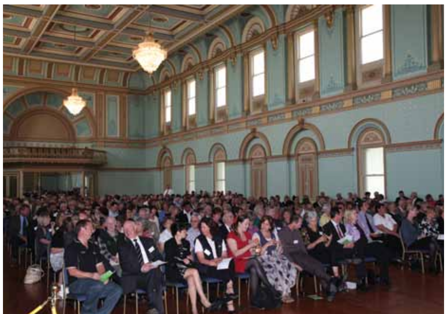
Members of Victoria's Landcare community gathered in the grand ballroom at Government House.

"The winners of the 2011 Victorian Landcare Awards embody the enthusiasm and commitment that has made Landcare