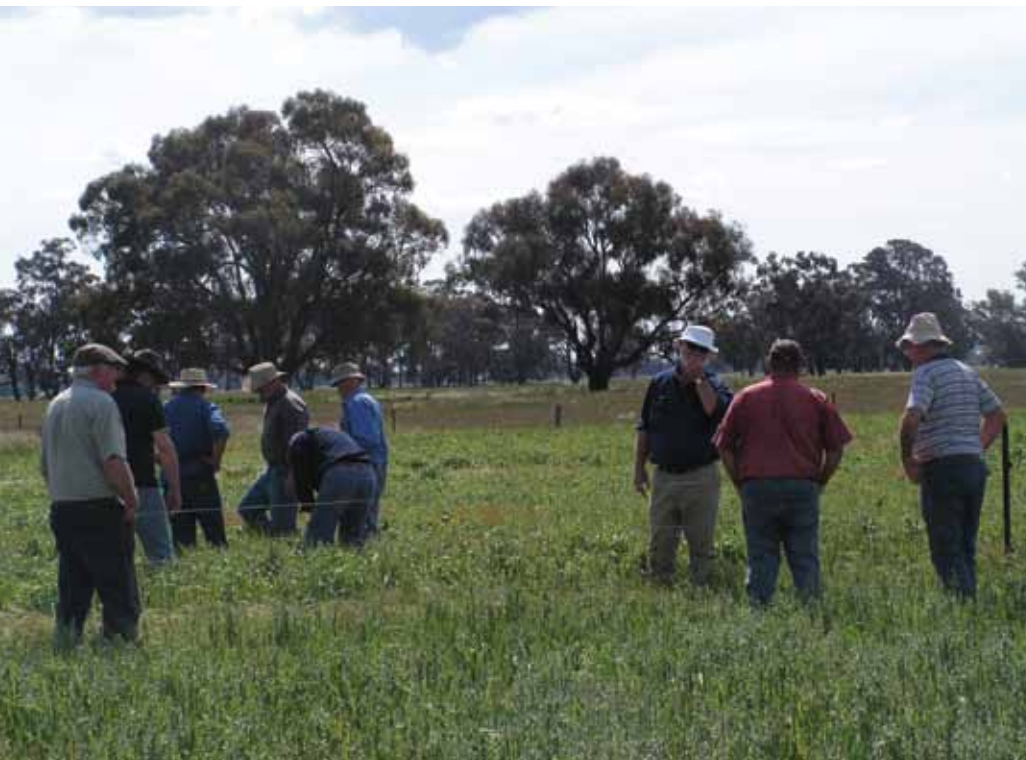
Farmers involved in the Gecko CLaN pasture cropping project assess ground conditions at a grazing management field day in September this year.