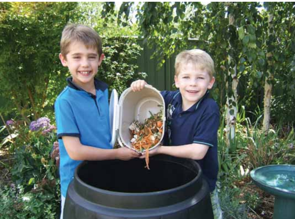
Corangamite Shire worked with the South West Waste Reduction Group to provide free kitchen scrap bins to encourage residents to compost at home and through the kerbside greenwaste system.