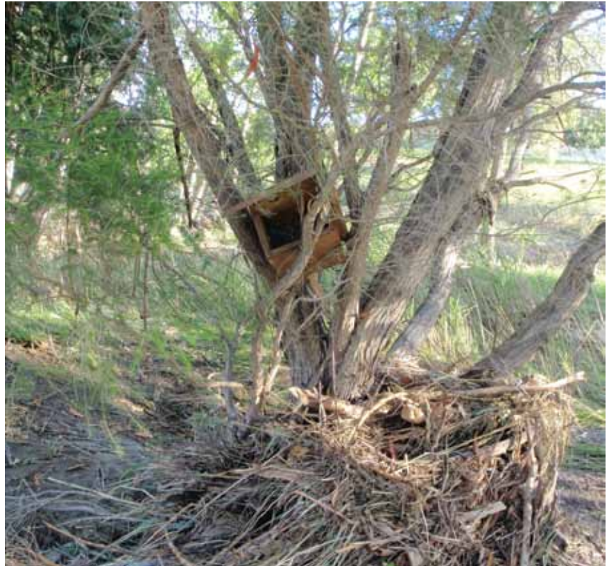
Floods in Wodonga last year dislodged nest boxes and uprooted newly planted trees in Willow Park, but the friends group is undeterred.

The group has undertaken revegetation works, constructed nest boxes for locally endangered squirrel gliders and completed Waterwatch monitoring in the park in