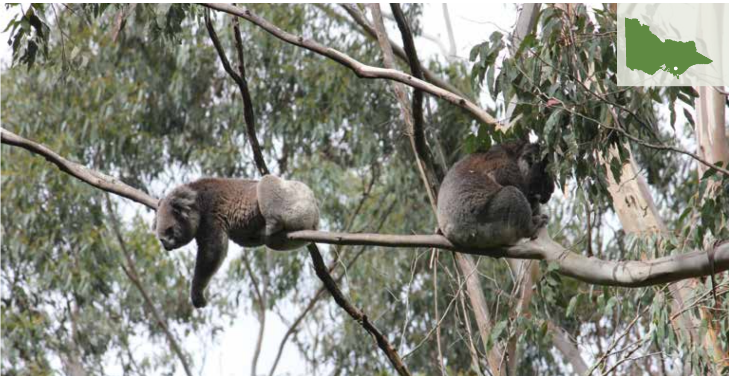
Koalas resting in the Strzelecki Ranges. It is unusual to see them sharing the same tree.