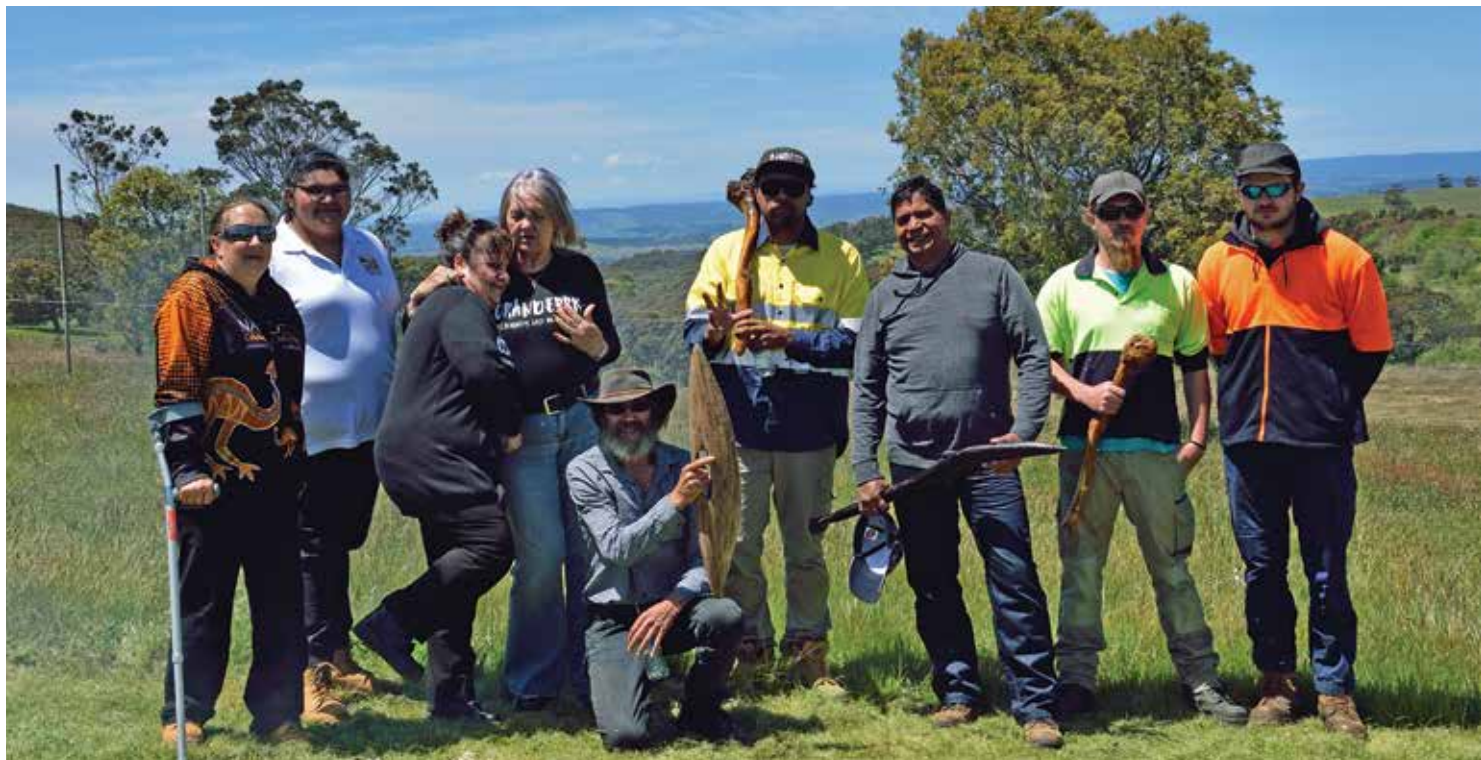
Wurundjeri Elders, land management team and community members at the partnership signing agreement event at Mt William stone axe quarry in November 2016.