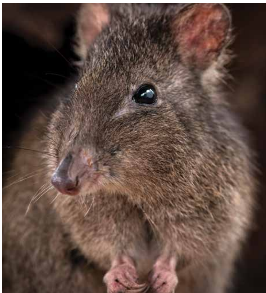
The Southern Otway Landcare Network's crowdfunding campaign helped to raise funds to continue work on habitat monitoring and restoration for threatened species including the Long-nosed Potoroo.

You are seeking funding to continue doing the good community and environmental