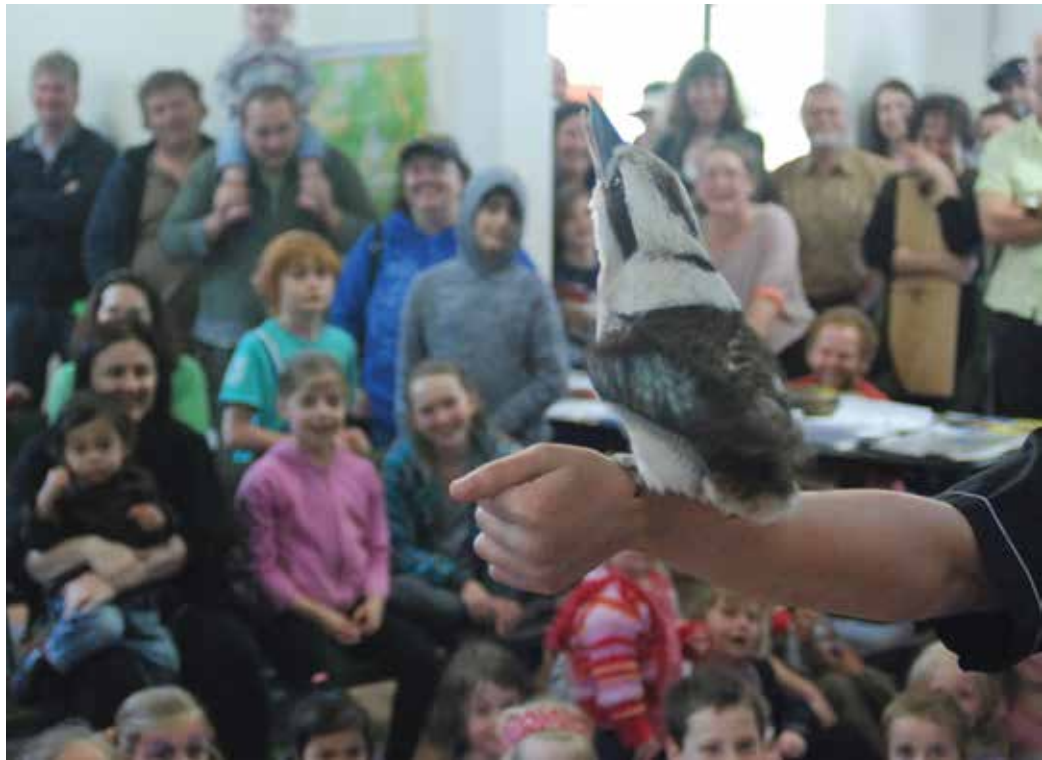
Cackles the kookaburra was a hit at the local primary school's spring fair.