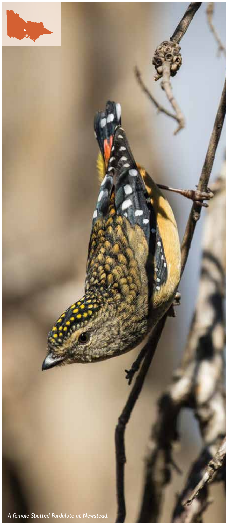
A female Spotted Pardalote at Newstead.