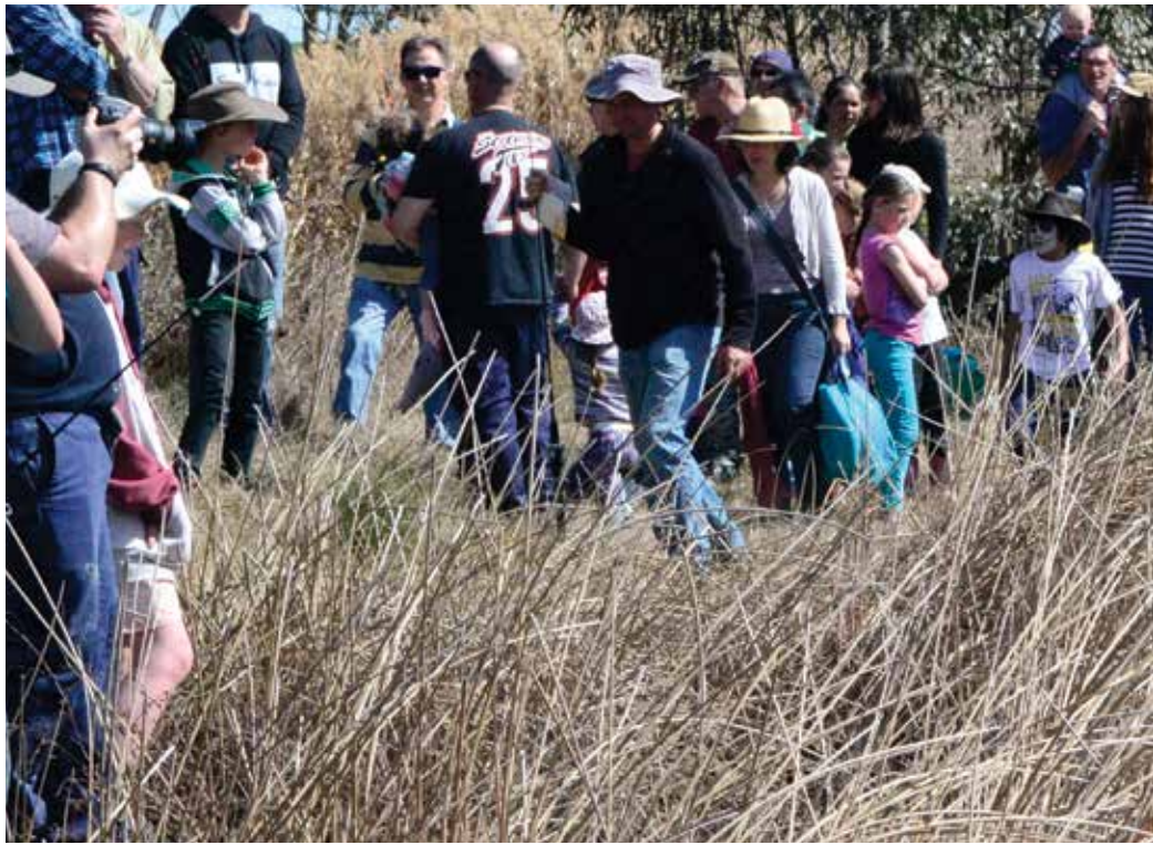
The Fish Circus featured a demonstration of electro-fishing.