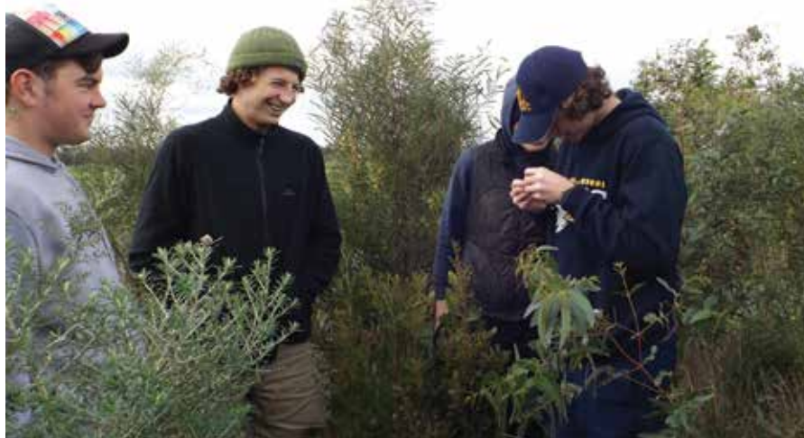
Students from South West TAFE visit the Sungold Field Days Allansford shelterbelt demonstration site.

For further information contact Lisette Mill at Basalt to Bay Landcare Network basalttobay@gmail.com