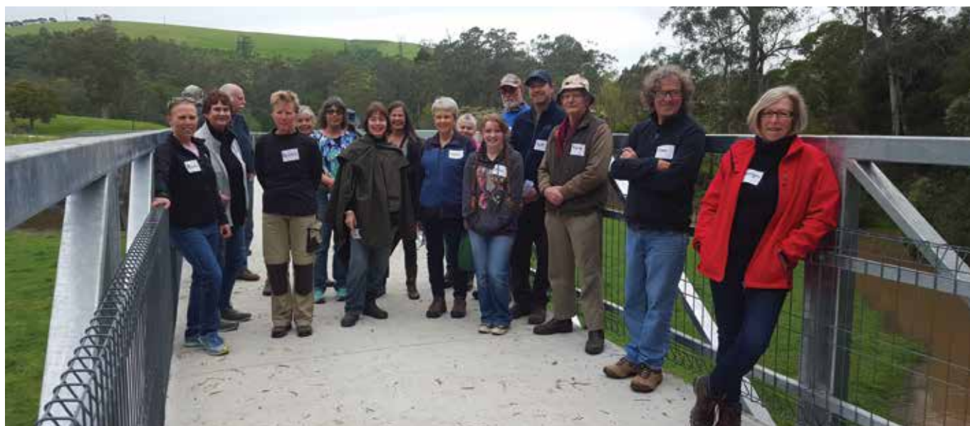
Members of the Nerrena Landcare Group standing on a South Gippsland Rail Trail trestle bridge spanning the Black Spur wetlands.