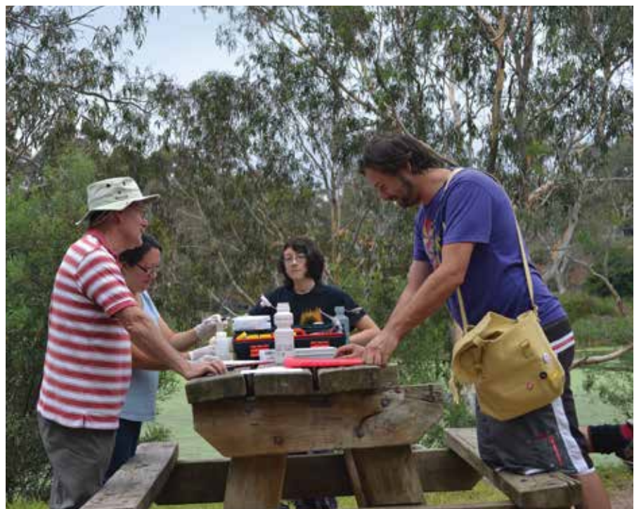
A WRivA Waterwatch activity at Bungeys Hole on the Werribee River in 2016.