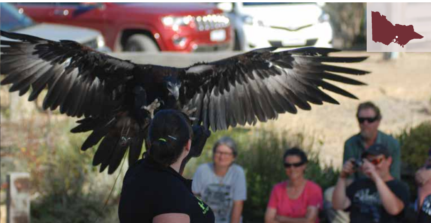
A flight display of birds of prey and an expert guest speaker encouraged people to attend the Christmas Hills Landcare Group's annual general meeting.