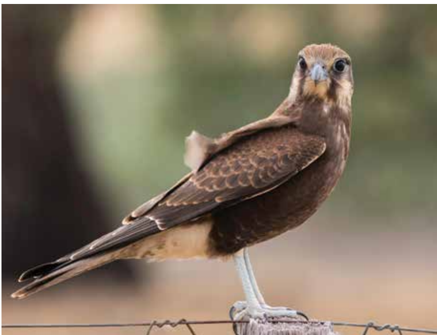
A Brown Falcon on the Moolort Plains.

My photography is constantly improving, but I'm always searching for the 'perfect image,' which still eludes me.