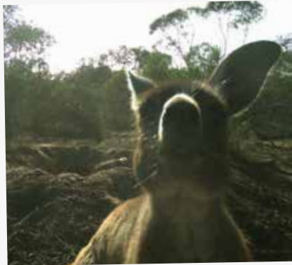
A remote sensing camera set up by the Mallee CMA on a landholder's property at Hattah captures a kangaroo and a Mallee fowl managing its nest.

For further information contact Joel Boyd on 5382 1544.