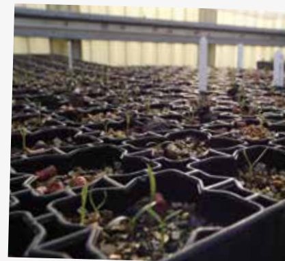
Native vegetation shelterbelt species for The Green Line project growing at the South West TAFE nursery at Warrnambool.

Students have responded to the project with enthusiasm. Many of them have little prior knowledge of conservation work. The project aims to teach them valuable skills that may be useful to their future careers and improve their understanding and appreciation of the local landscape. It is hoped students that graduate from the program may go on to be land managers.