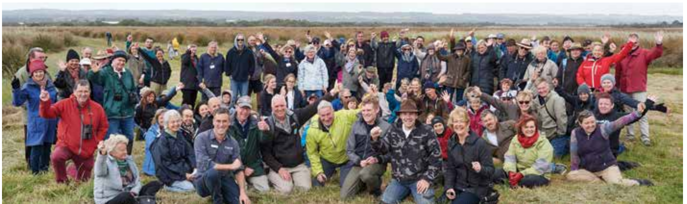
More than 100 people celebrate 30 Years of Landcare in the middle of the covenanted Tootgarook Swamp at Boneo Park Equestrian Centre at an event run by the Port Phillip and Westernport CMA.