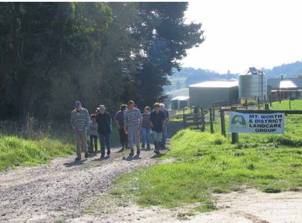
A farm walk on a large sheep property at Tetoora Road generated a lot of discussion.

“ Make sure there's plenty of time for people to network, ask questions and share information. ”