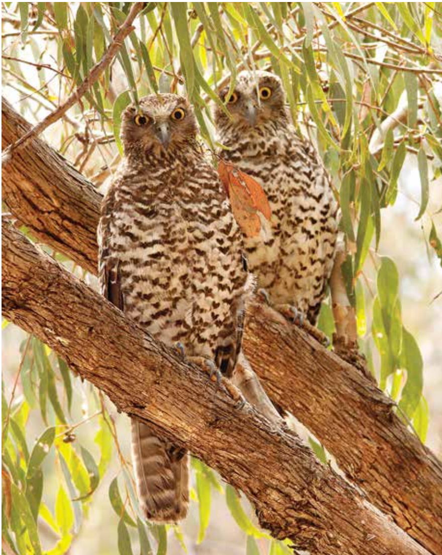
Powerful Owls at Muckleford.