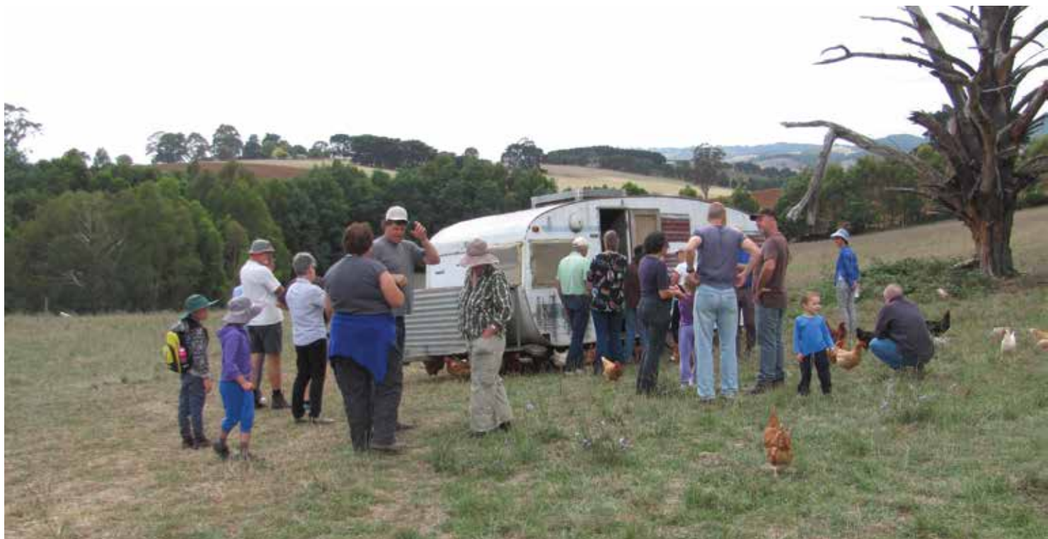
Participants inspect a caravan fitted out to house free-range chickens on an organic dairy farm near Warragul during a Mt Worth and District Landcare Group farm walk.