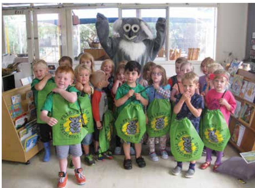
Fosky the Koala was popular at the Fish Creek Kindergarten.